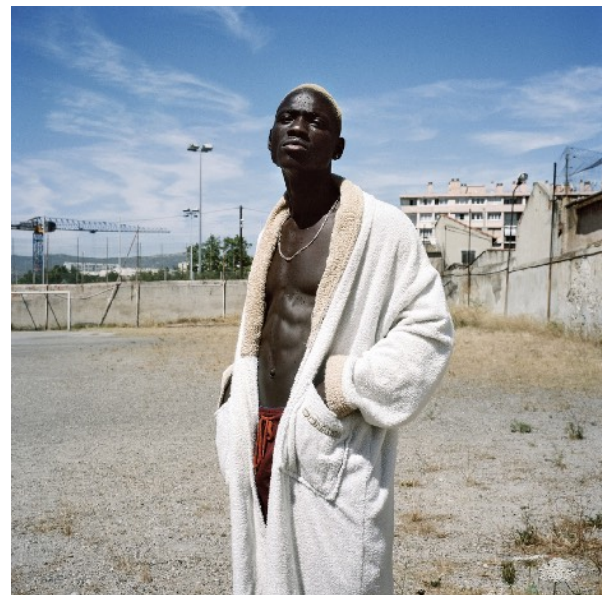
Courage. Saint-Mauront, 2019