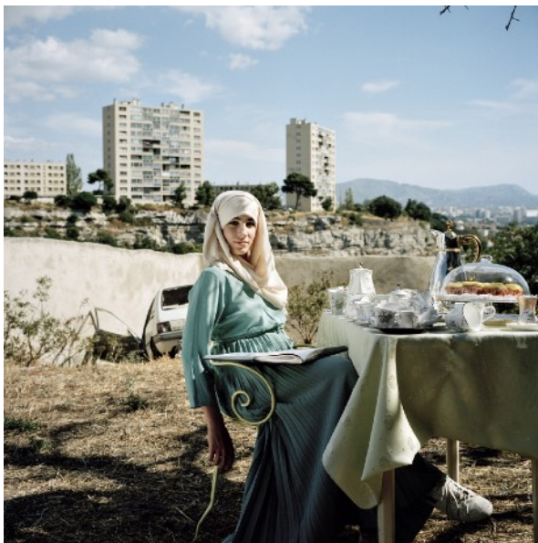
Cheyreen au pays d'Alice, La Viste, 2020