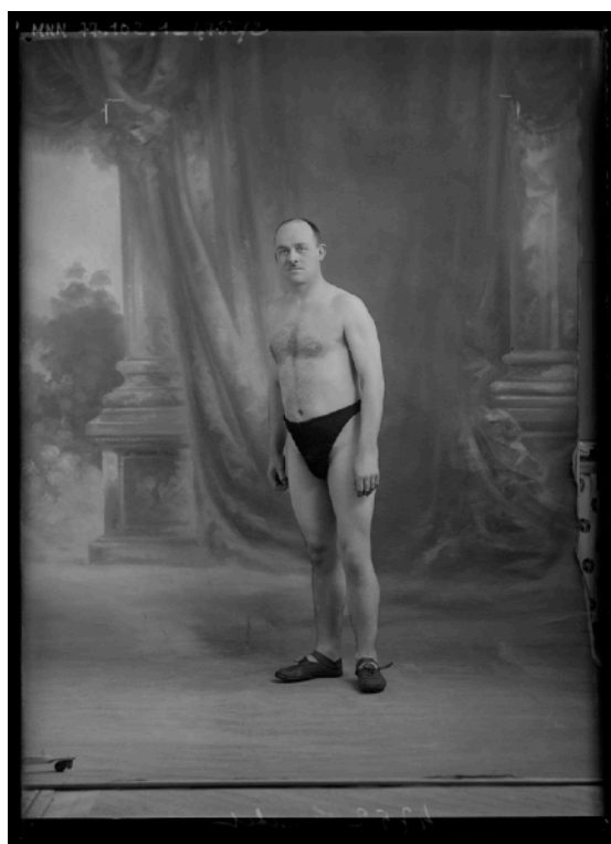
Untitled. Germain Eblé © musée Nicéphore Niépce, ville de Châlon-sur-Saône