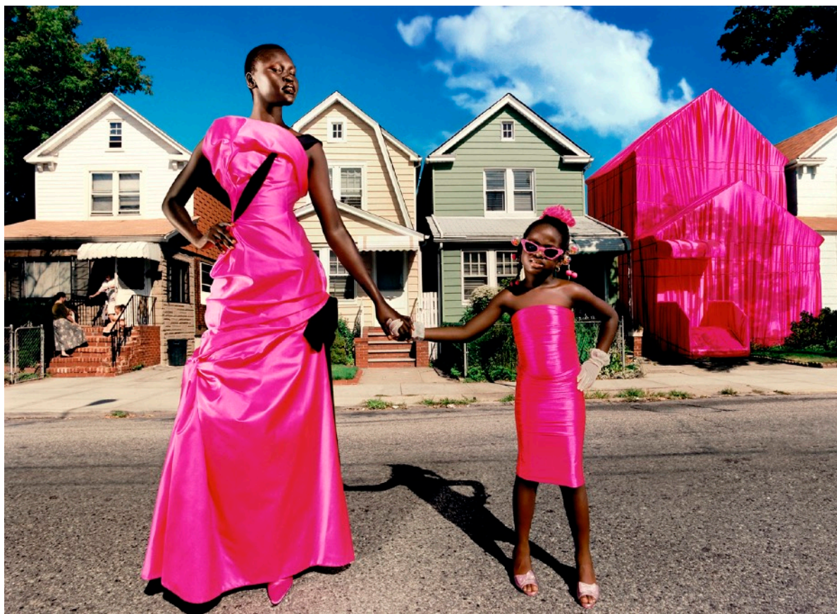
This is my house. New York, 1997 © David LaChapelle

Exhibition supported by Cinq Étoiles Productions