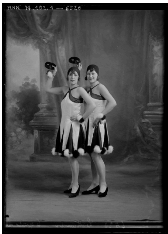
Untitled. Germain Eblé © musée Nicéphore Niépce, ville de Châlon-sur-Saône