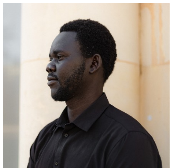
Thyang (South Sudan). Vichy, 2026