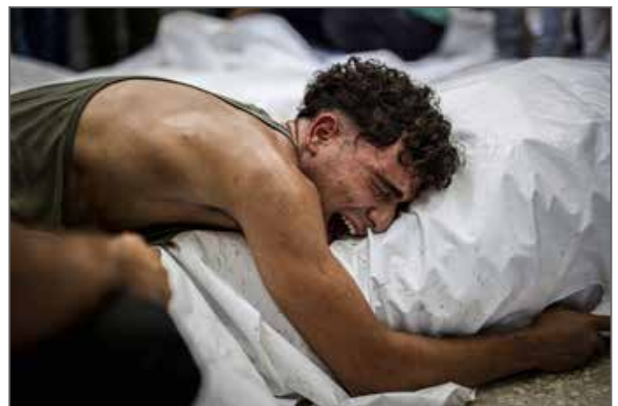
Winner of the 2025 ICRC Humanitarian Visa d'or Award