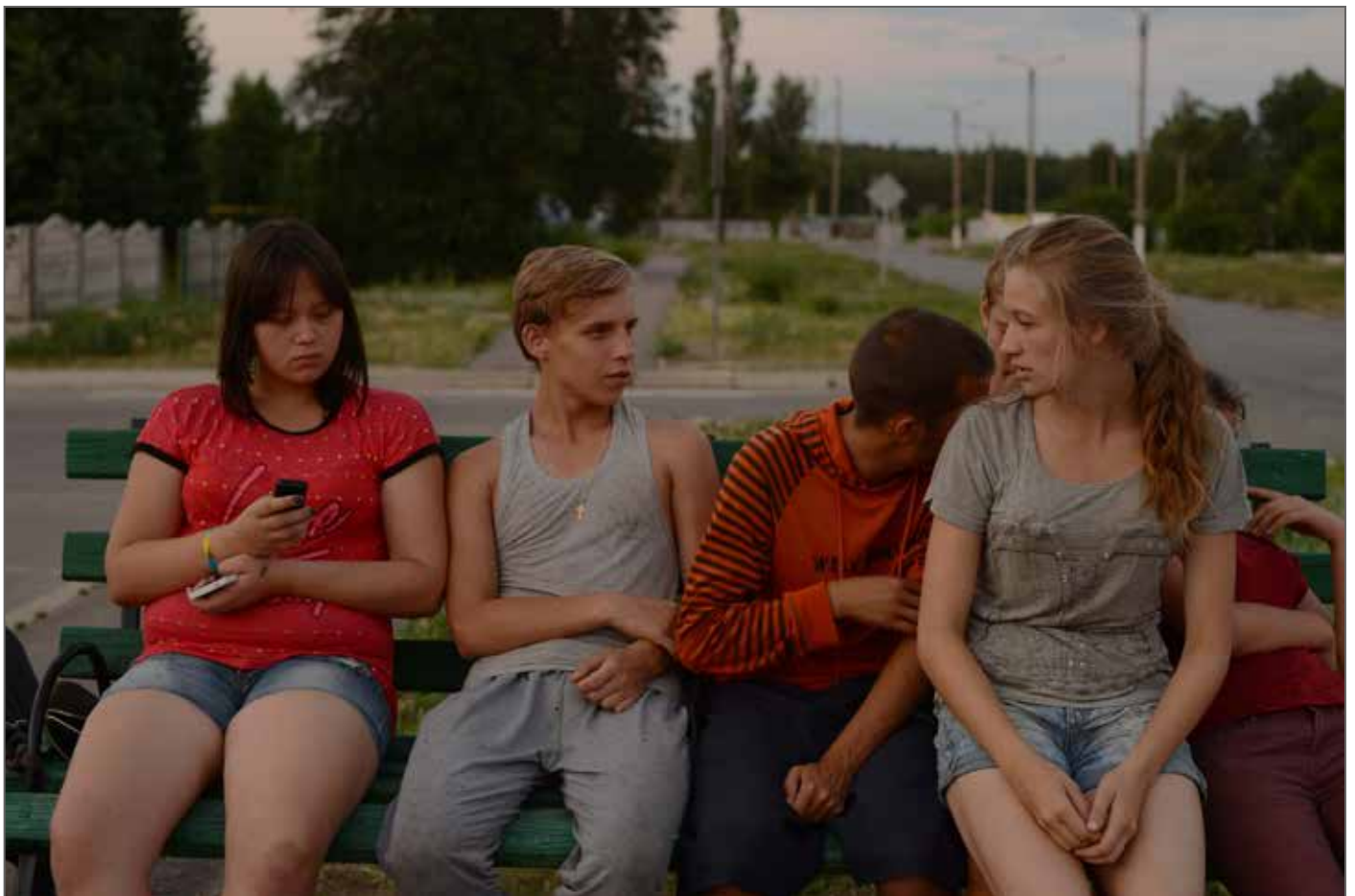
Winner of the 2025 Canon Female Photojournalist Grant

Both grants form part of a long-standing partnership of over 35 years between Visa pour l'Image and Canon.