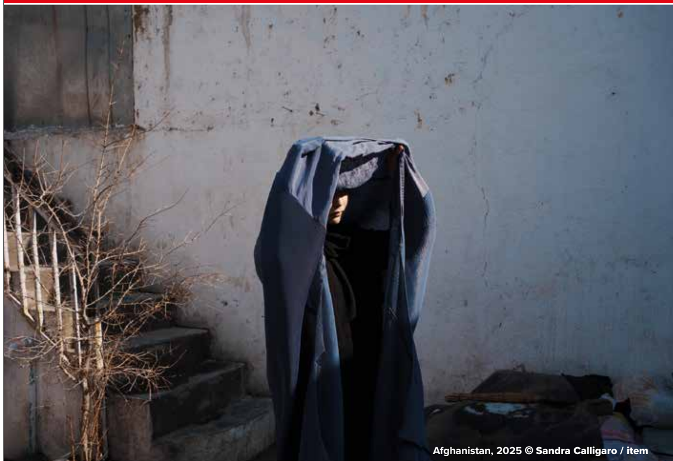
Afghanistan, 2025