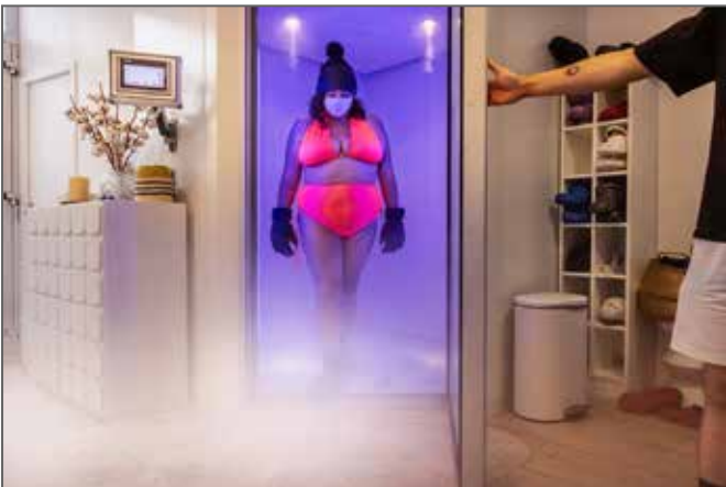
Winner of the 2025 Pierre & Alexandra Boulat Award