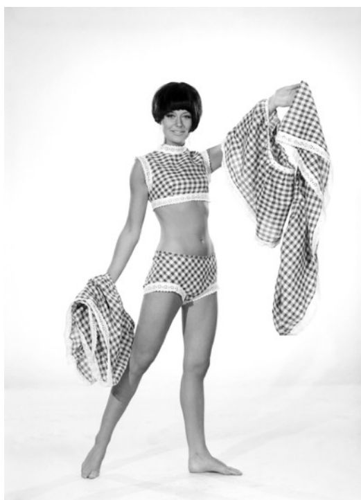
Young woman wearing a gingham bathing suit, 1966

Whether Brigitte Bardot's puffy skirt, Lauren Bacall's jacket with rolled-up sleeves, Frank Sinatra's casual shirt, Sheila's bikini, Lady Di's pink trousers, or even our grandmothers' kitchen aprons, we can all remember a little piece of Vichy (or gingham) checked fabric, which seems to epitomise the carefree years of our youth. This fashion was first launched in France by Empress Eugenie. The dignitary would vacation in Vichy, where a local spinning mill produced these woven, checked cottons destined for greatness. Through a rich selection of images, dating from the mid-19 th century to the present day and sourced from the press, fashion and film, the Vichy Check is enjoying a revival this summer on the esplanade of Lac d'Allier.