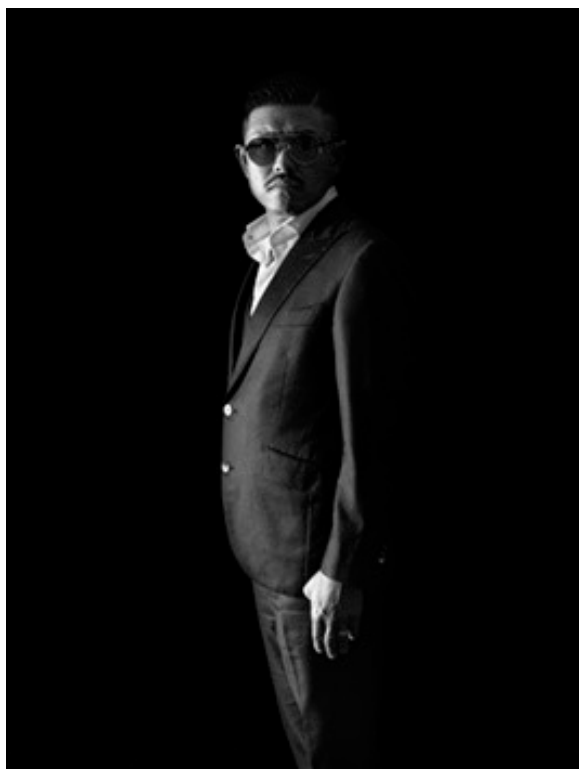
Untitled. Series Japan , 2017

Exhibition supported by Cinq Étoiles Productions