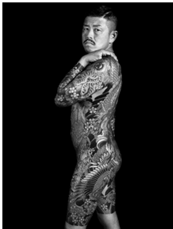
Untitled. Series Japan , 2017