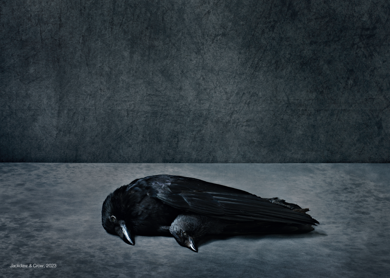
Jackdaw & Crow, 2023