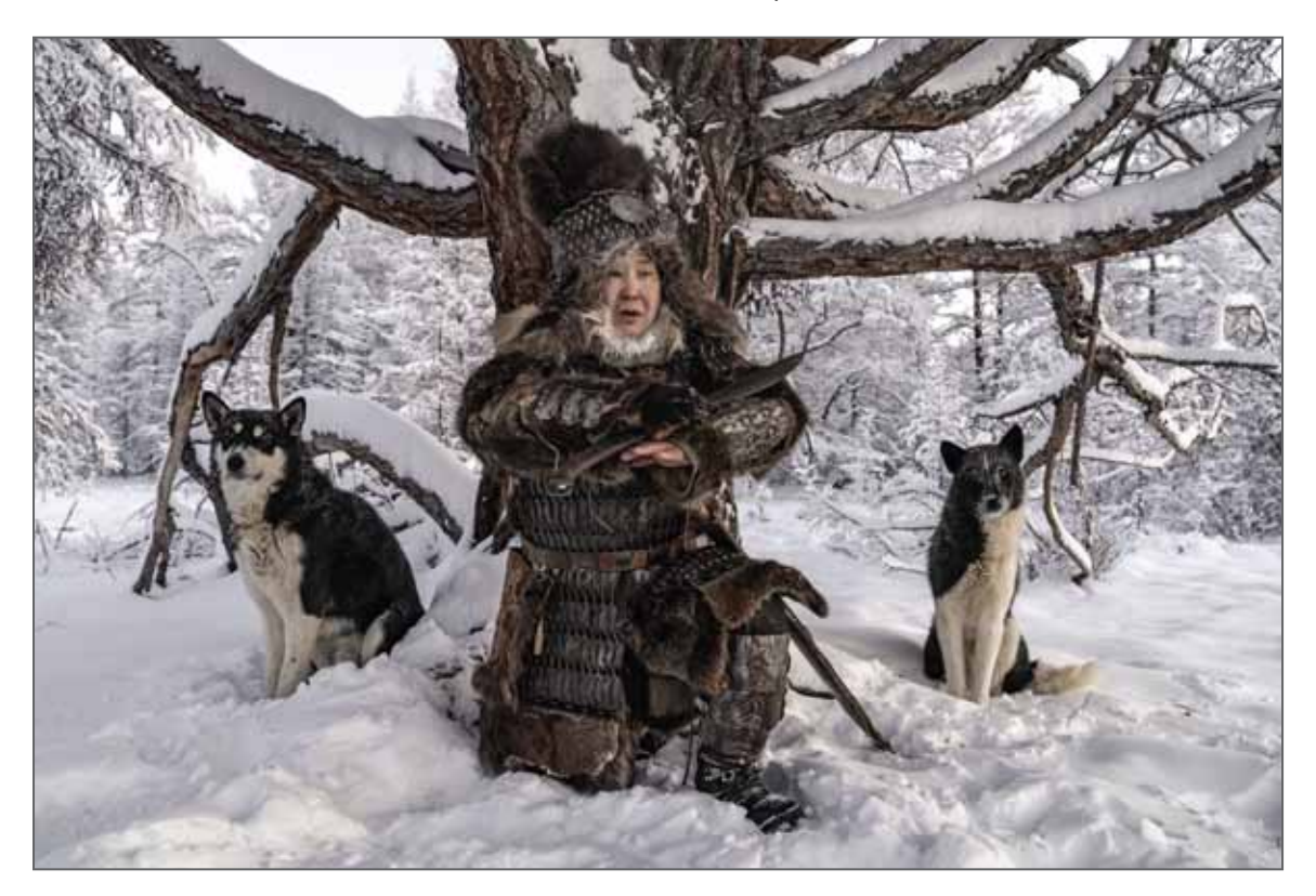
Winner of the 2022 Canon Female Photojournalist Grant

Many valuable resources are to be found in northern Russia, for example gold and diamonds, plus the wealth of cultural heritage of the indigenous Evenki people on their land in Yakutia where they endeavor to carry on their traditional lifestyle in the face of industrial-scale mining. The Evenki are traditional reindeer herders, but they were the people who, in the then Soviet Union, helped prospectors find deposits and sites that led to the development of the mining industry there. Today, massive swaths of the boreal forest have been destroyed, river beds have been devastated, and water tables polluted.