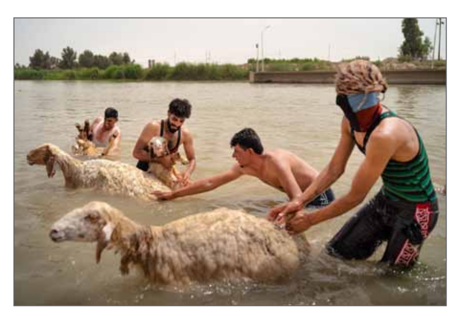
Winner of the 2023 Ville de Perpignan Rémi Ochlik Visa d'or Award

Exhibition coproduced by the NGO CCFD - Terre Solidaire.