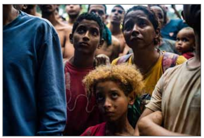
© Federico Rios Escobar Winner of the 2023 Humanitarian Visa d'or Award - International Committee of the Red Cross (ICRC)