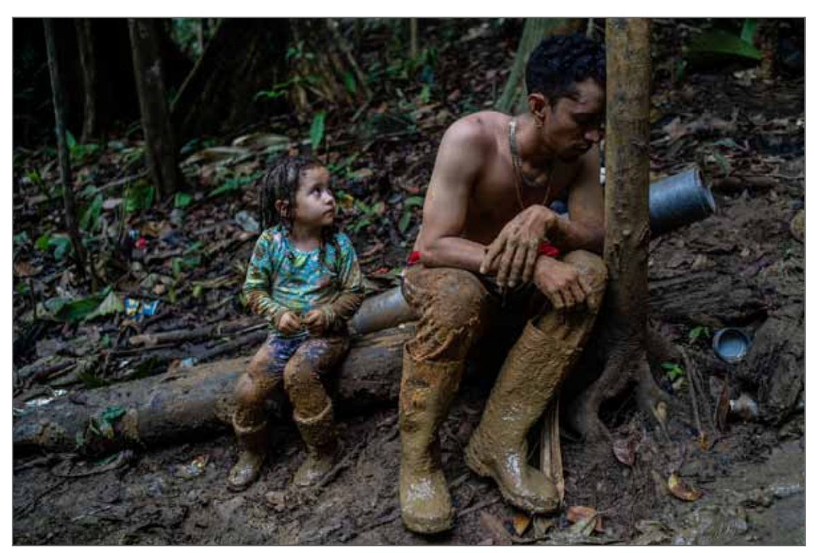
Winner of the 2023 Humanitarian Visa d'or Award - International Committee of the Red Cross (ICRC)

In 2022, the overwhelming majority of people crossing the Darién Gap connecting South and Central America were Venezuelan. Many have been worn down by years living in a failed economy, but they are just part of a diverse range of migrants walking through the jungle. Others crossing in significant numbers are from Cuba, Haiti, Ecuador and Peru, and there are also Afghans fleeing the Taliban who now form one of the fastest growing groups. The migrants travel wearing shorts and flip-flops, their possessions stuffed in plastic bags, babies in their arms, and small children holding their hands. It is not clear how many have made it, and how many have not.