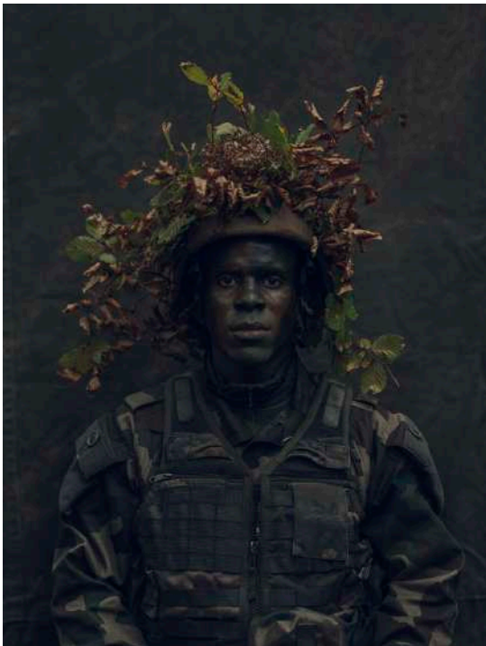
Committed young man, soldier on the grounds of the Initial Training Centre for non-commissioned members (CFIM), at Bitche (Moselle)

These photographs were produced within the framework of the nation-wide command "Radioscopie de la France: regards sur un pays traversé par la crise sanitaire" funded by the Ministry of Culture and managed by the French National Library.