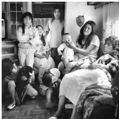
Famille Gorgan, Arles, 1995