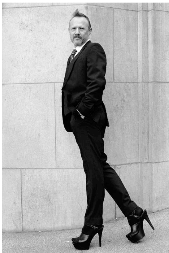
Untitled, Brussels, 2016