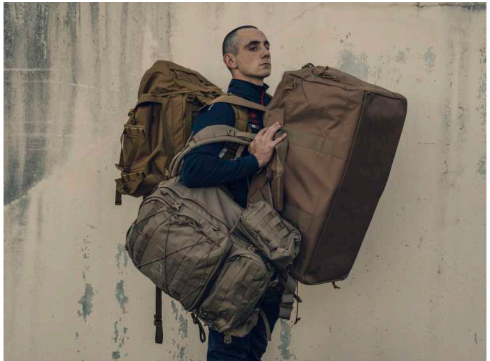
Training Non-Commissioned Officer on receipt of his pack at ENSOAT, Saint-Maixent, the National School for Army Non-Commissioned Officers)