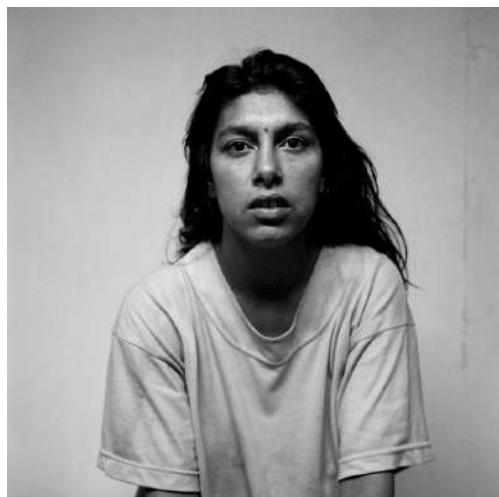
Sivillia, Arles, 1995 © Mathieu Pernot. Neuflize OBC Enterprise Collection