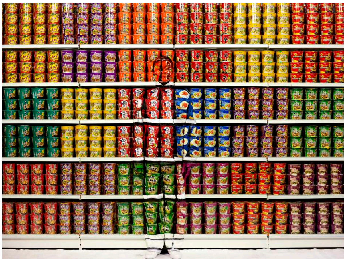
Instant Noodles, Hiding in the City, 2013 © Liu Bolin. Courtesy GALERIE PARIS-B