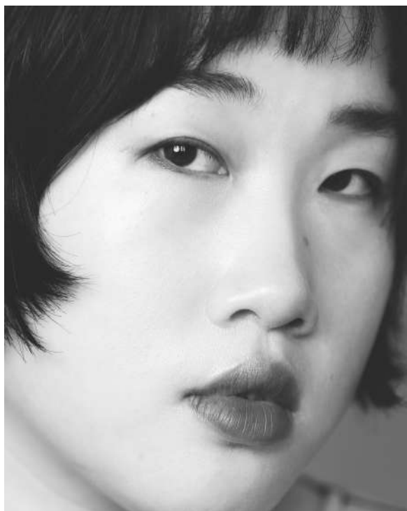
Dalle, 2022