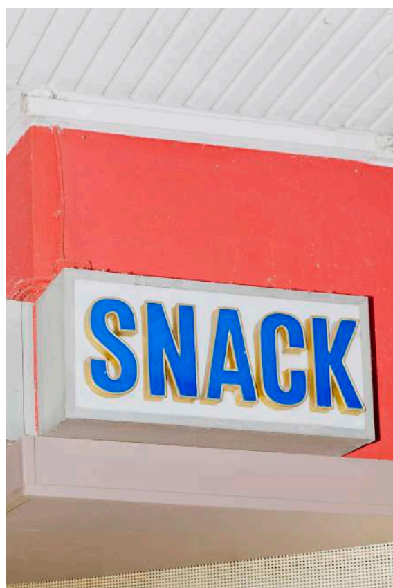
Quadrille. Snack