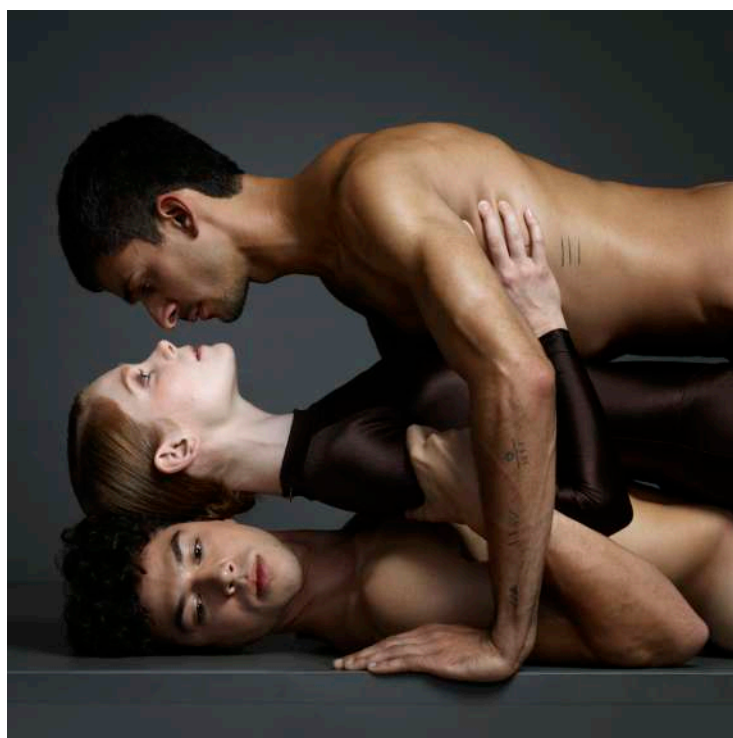
Kleines Requiem. Série Dance in Close-Up, choreographer Han Van Manen, 2022

Erwin Olaf is represented by the Galerie Rabouan-Mousson, Paris