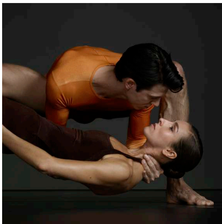
Kammerballet V. Série Dance in close-up, choreographer Han Van Manen, 2022