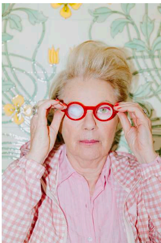
Quadrille. Dominique