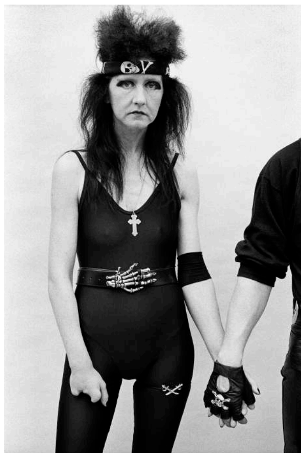
Untitled, Wetteren, 1991