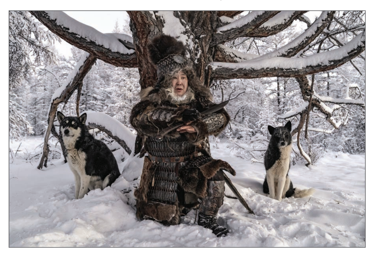
Winner of the 2022 Canon Female Photojournalist Grant

Many valuable resources are to be found in northern Russia, for example gold and diamonds, plus the wealth of cultural heritage of the indigenous Evenki people on their land in Yakutia where they endeavor to carry on their traditional lifestyle in the face of industrial-scale mining. The Evenki are traditional reindeer herders, but they were the people who, in the then Soviet Union, helped prospectors find deposits and sites that led to the development of the mining industry there. Today, massive swaths of the boreal forest have been destroyed, river beds have been devastated, and water tables polluted.