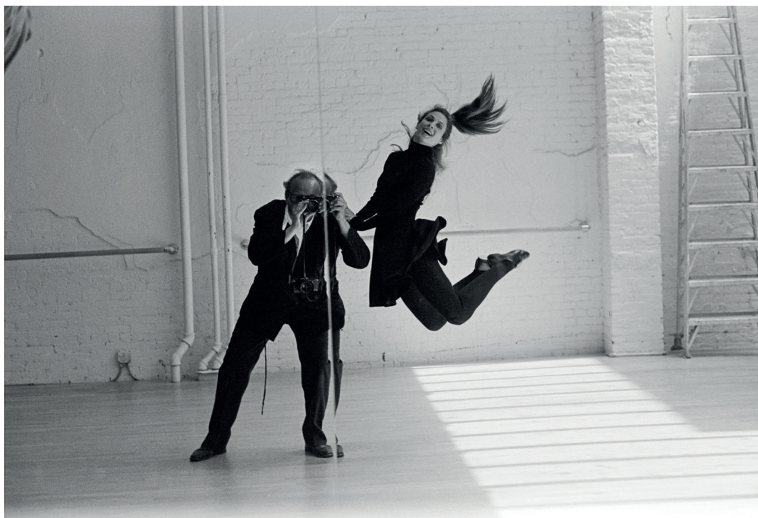
Arthur Elgort and Grethe Holby Elgort, New York City, 1987