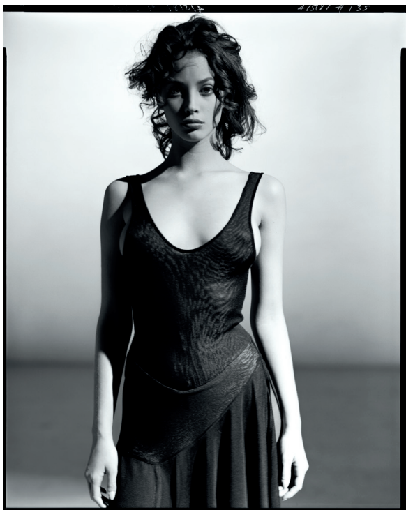
Christy Turlington, New York City, 1987