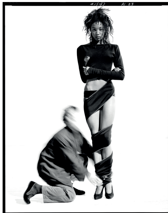
Naomi Campbell and Azzedine Alaïa, New York City, 1987