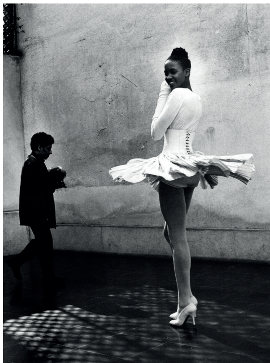
Naomi Campbell and Azzedine Alaïa, Paris, 1986