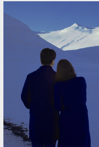
Lovers. 2019

Kittenproduction.com Sheriffprojects.com