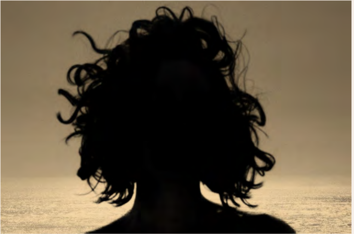
Océan

“There are parallels with the sort of winemaking that takes place at Château Palmer. The teams are totally devoted, tirelessly improving while remaining open to mystery, to the things we can’t control. I believe that true beauty lies in imperfection, tiny mistakes, the edges and the unexpected.”