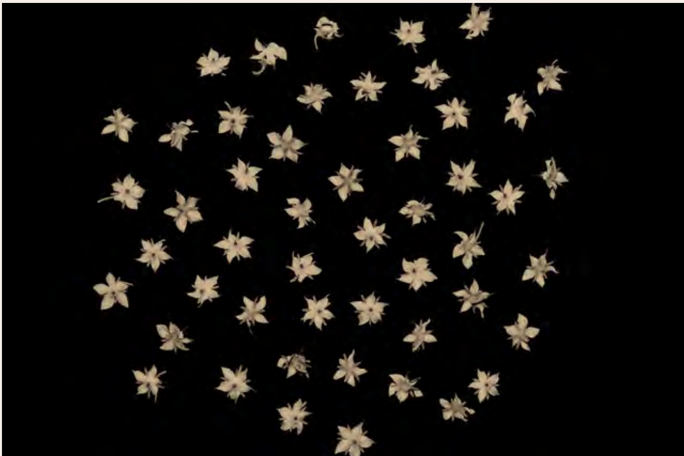
Alors on danse

The connection Château Palmer cultivates with photography is both profound and sincere. The estate has welcomed exhibitions by Jean Gaumy, Guy Le Querrec, Sebastião Salgado, and Raymond Depardon. The artistic residency project, created with the support of Leica, hopes to sustain this connection beyond the estate through the perspectives of photographers in tune with the château's holistic world.