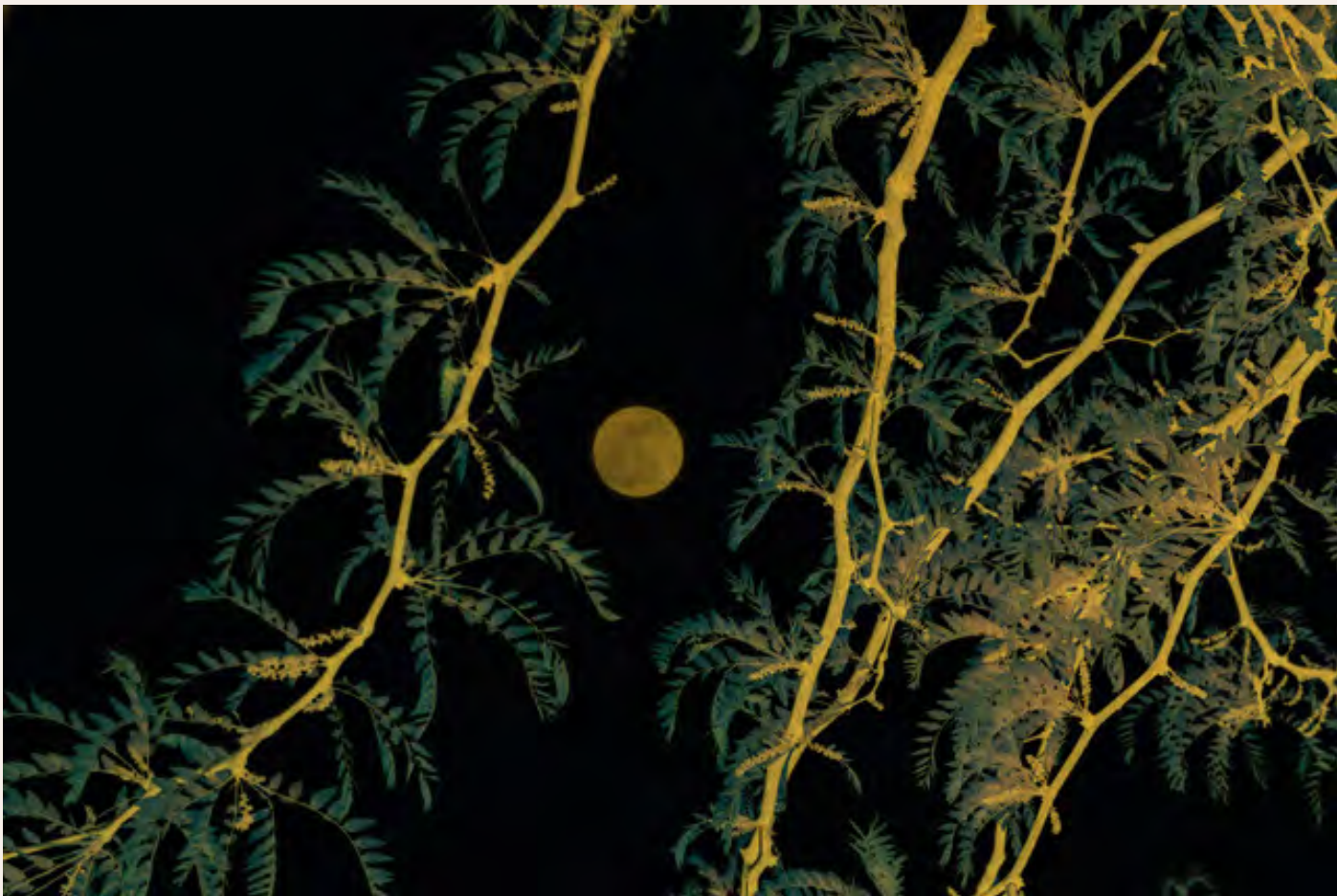
Lune pour la résidence INSTANTS, Château Palmer et Leica, 2022

Art Photo Projects advises and guides institutions and businesses in the artistic direction of their cultural projects.