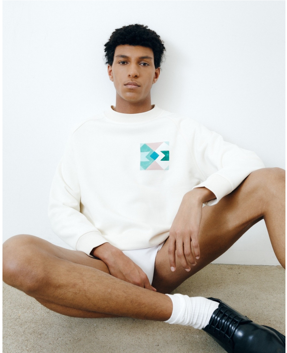
PAINTING: AURÉLIEN DELAHAIES