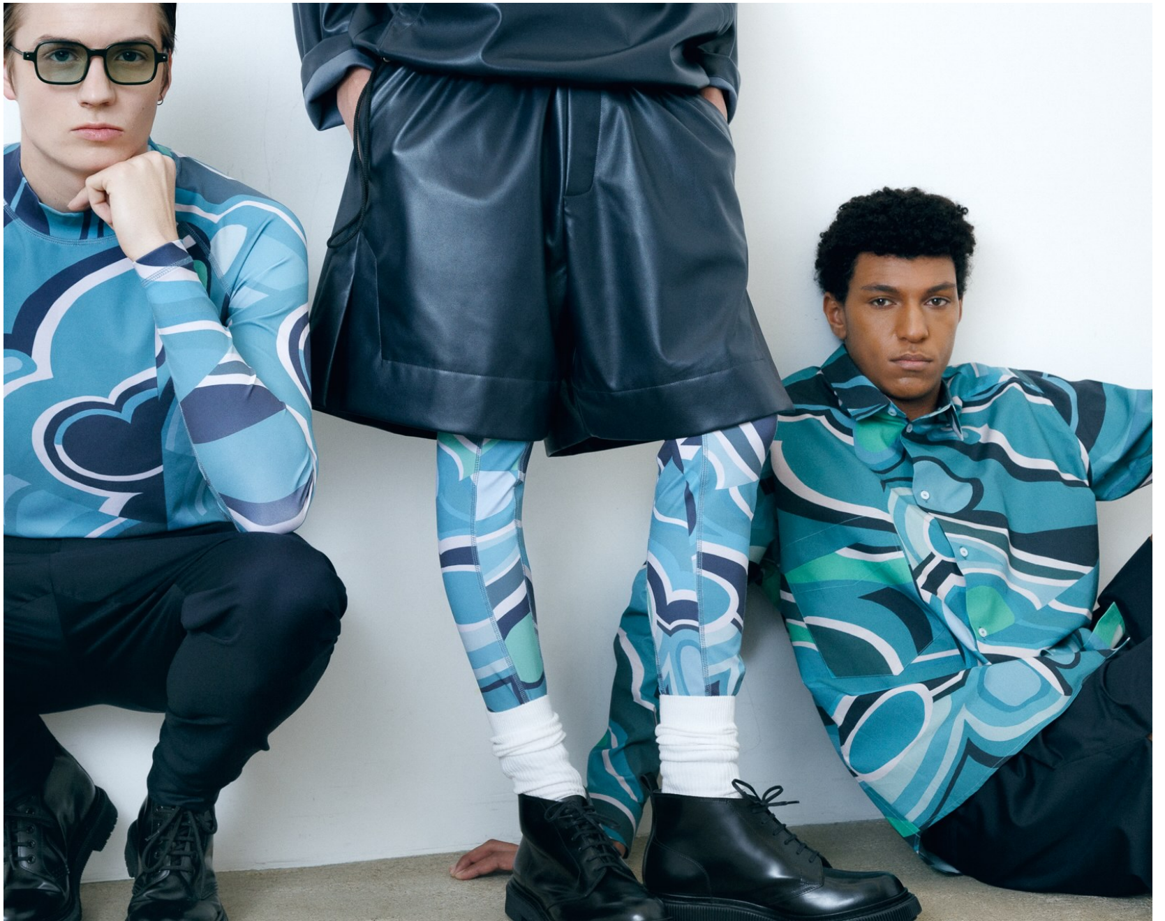
ART COLLAB FW22: MWORKS + JEANNE DETALLANTE