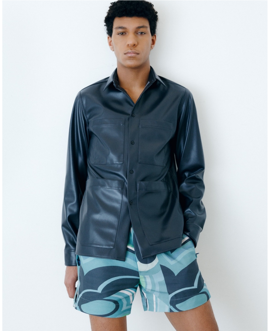
ART COLLAB FW22: MWORKS + JEANNE DETALLANTE