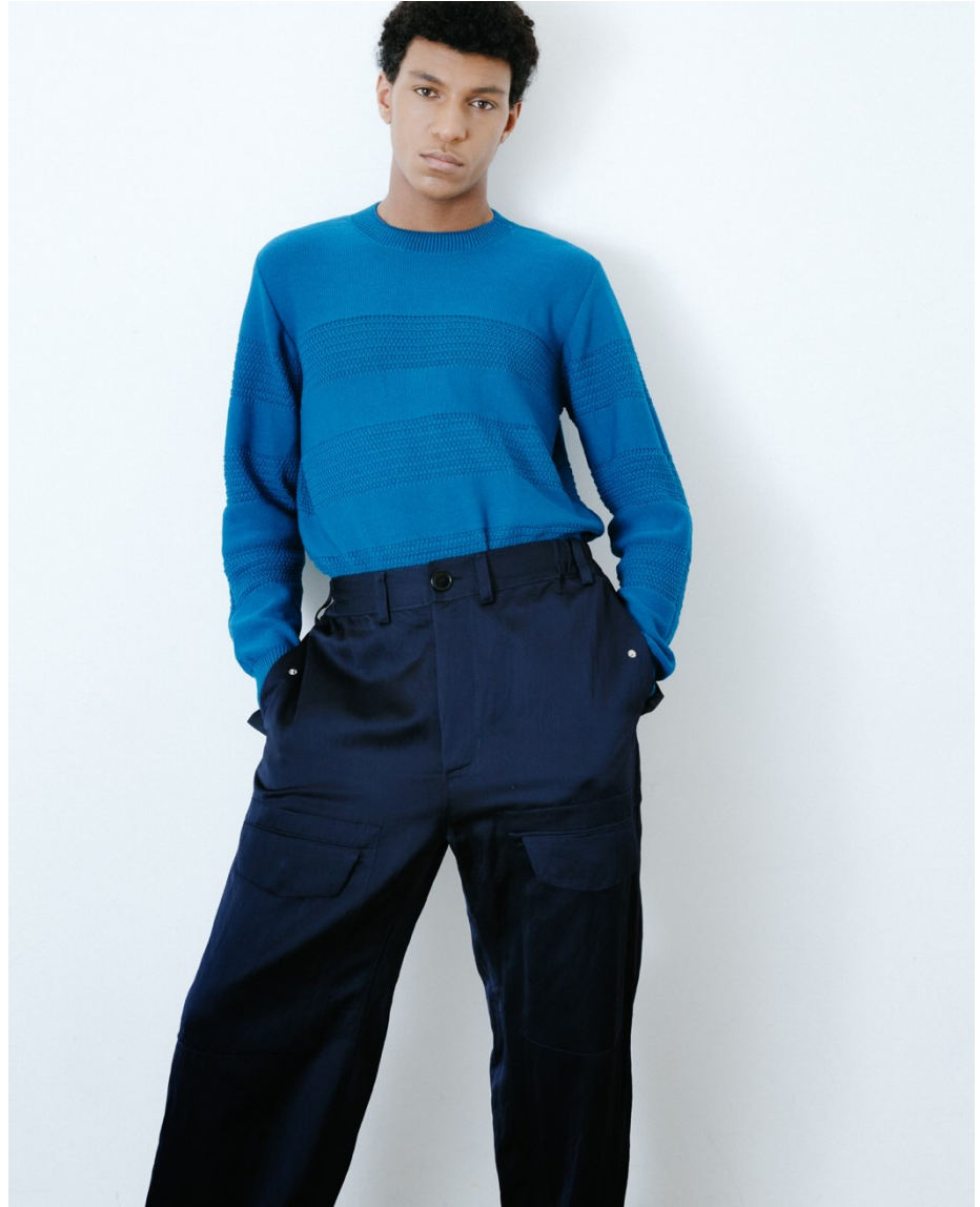
ATELIER COWORKING: LES TROIS TRICOTEURS