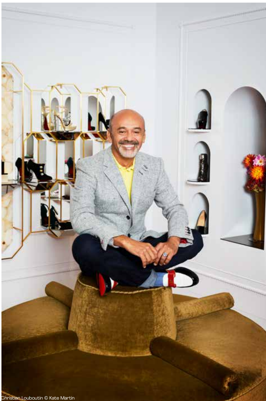
Christian Louboutin