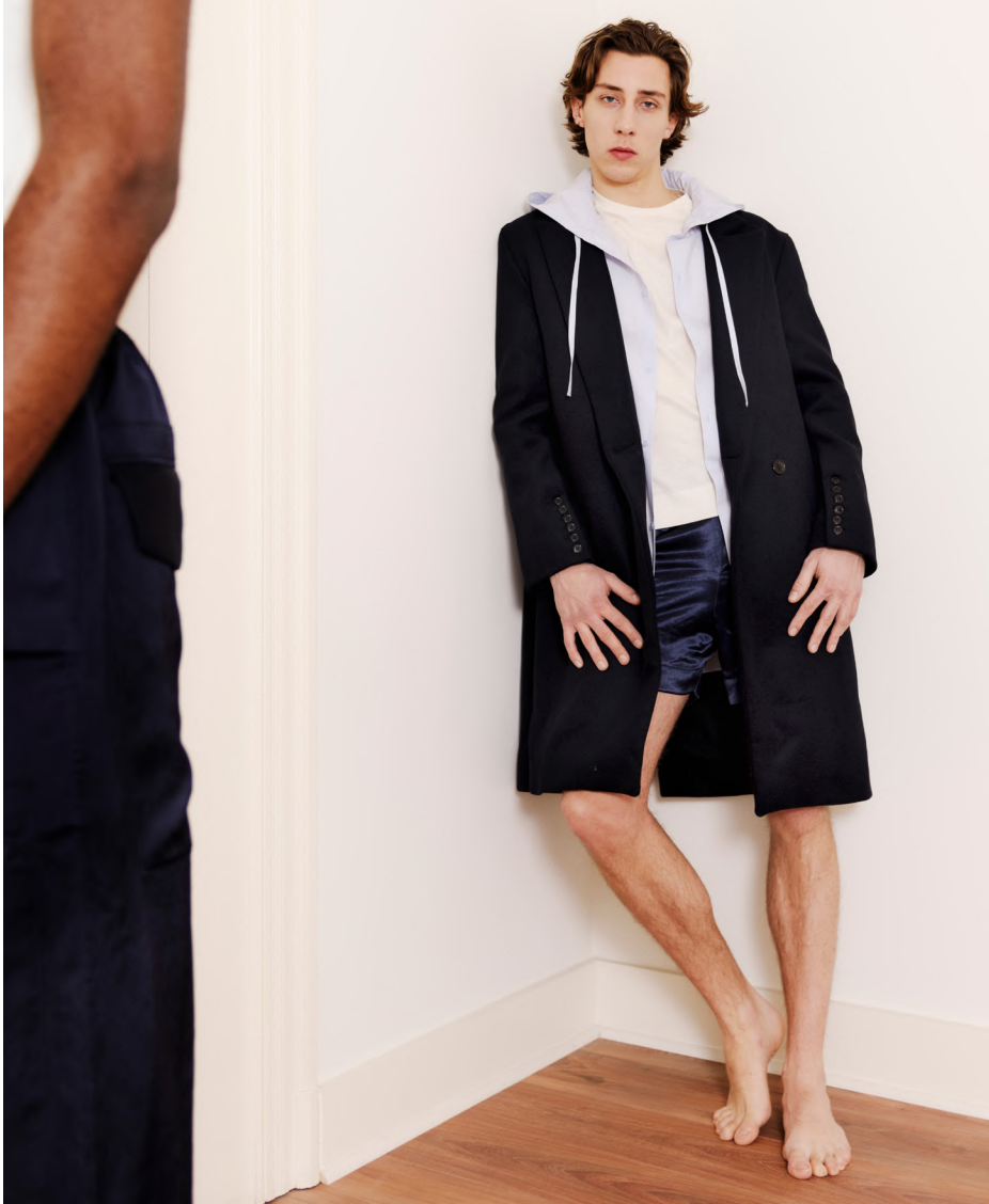
ABOVE: MINI SHORTS SATIN, T-SHIRT, HOODED SHIRT & WINTER COAT OPPOSITE: ELASTIC SLIT SHORT, OVERSIZE SHIRT, HOODIE SATIN