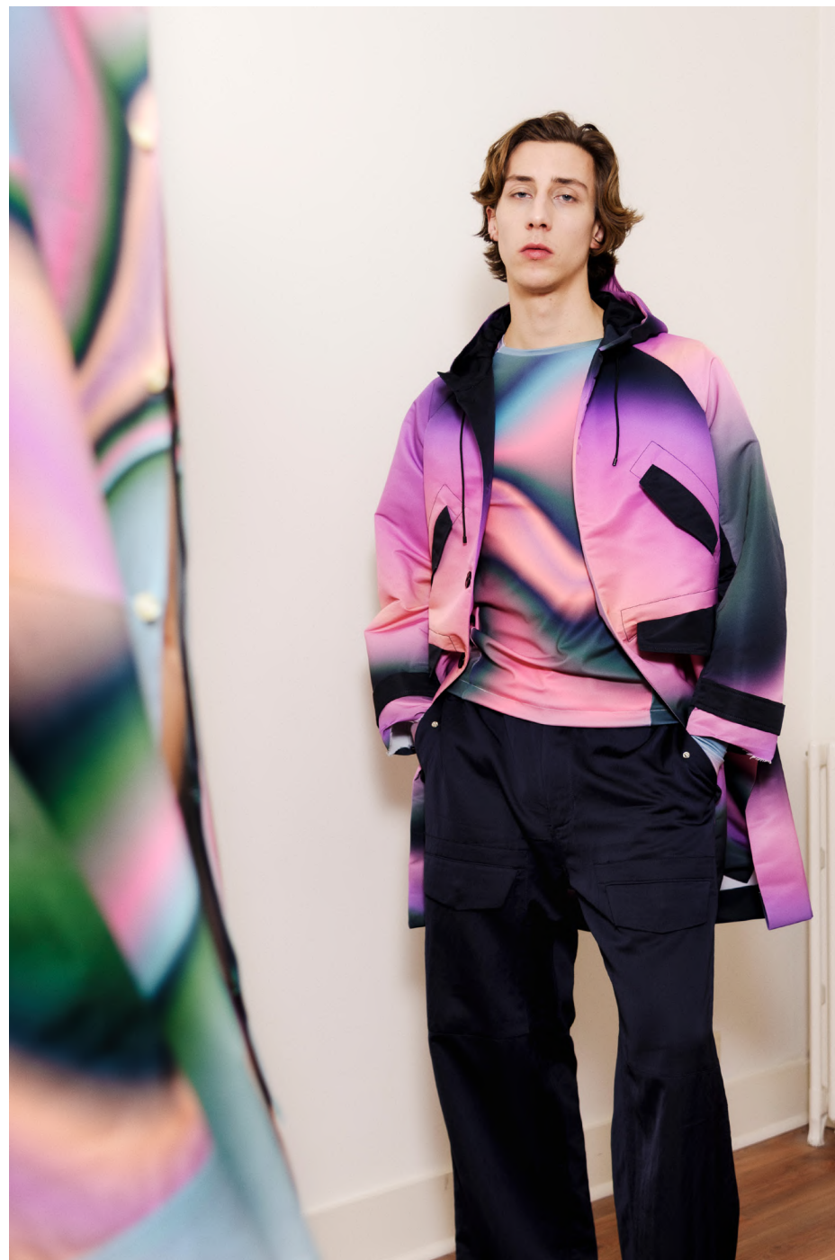
OPPOSITE: PARKA RECYLED POLYESTER, LONG SLEEVE TSHIRT LYCRA & LARGE CARGO PANT