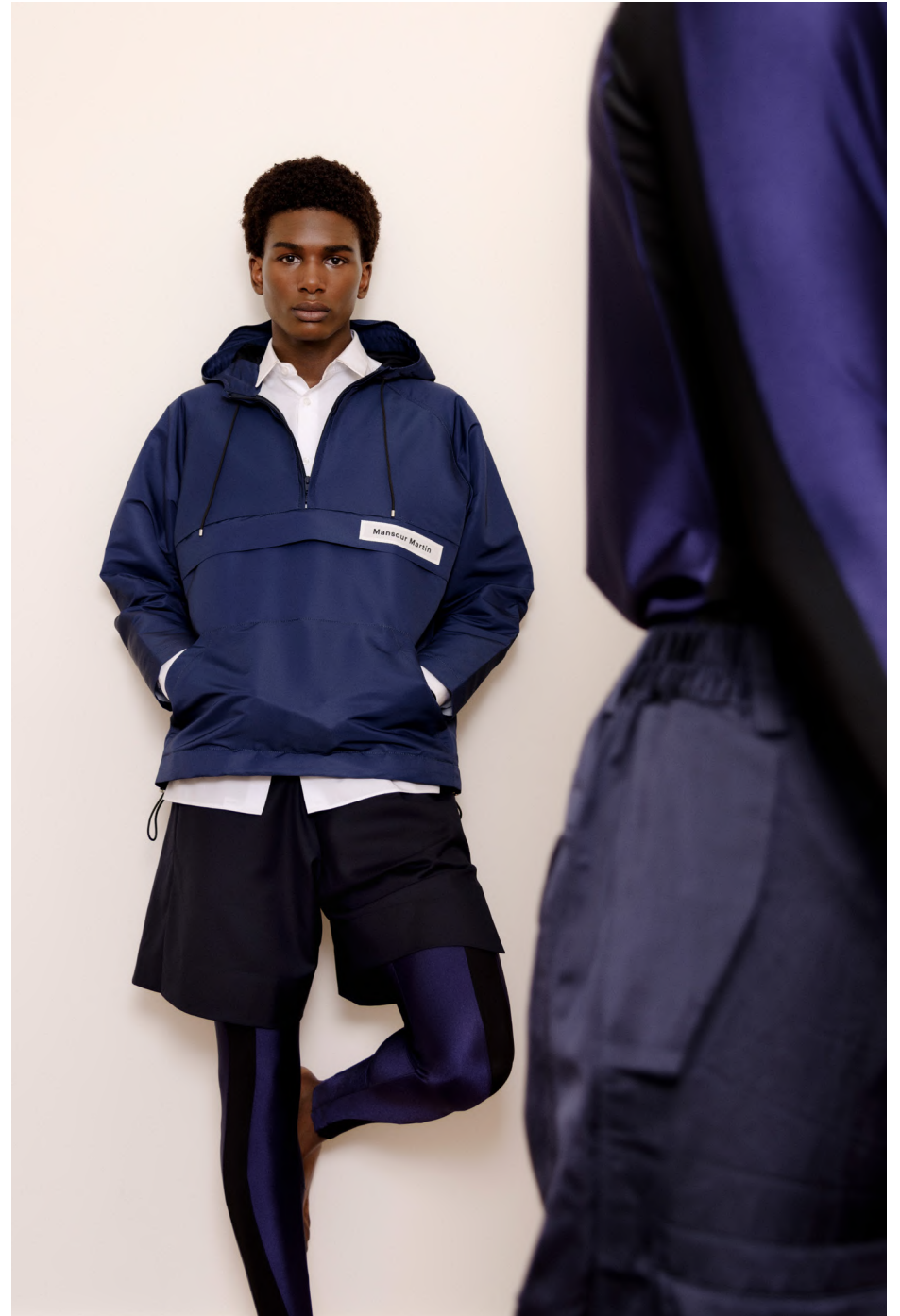
OPPOSITE: WINDBREAKER, ELASTIC SLIT SHORTS, LEGGING LYCRA, CLASSIC SHIRT