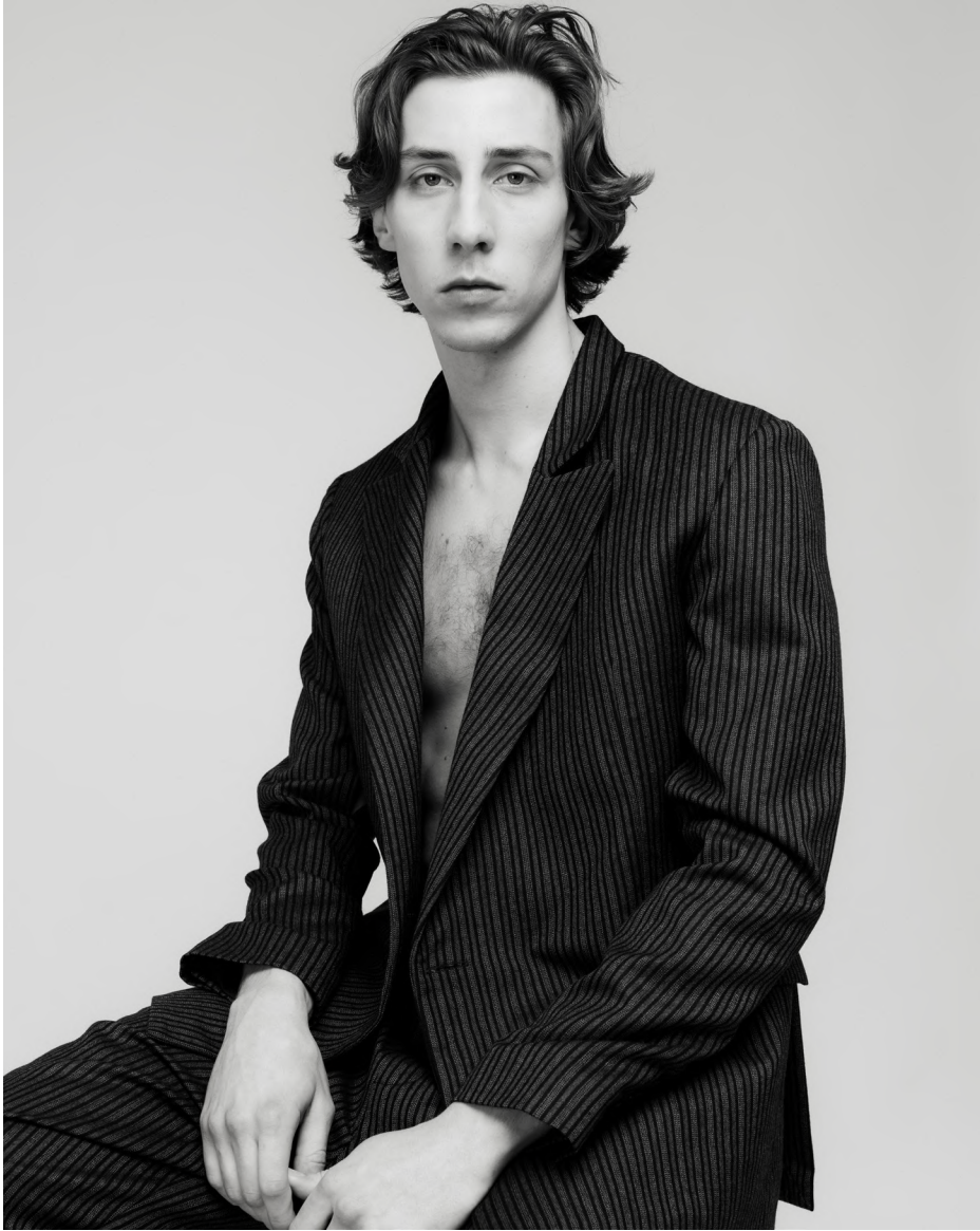
ABOVE: FETISH JACKET OPPOSITE: FETISH JACKET, PLEATED PANT, CLASSIC SHIRT