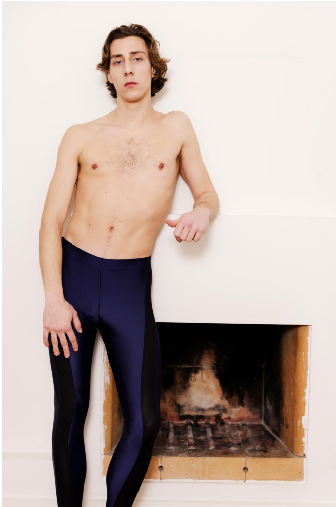
ABOVE: LEGGING LYCRA