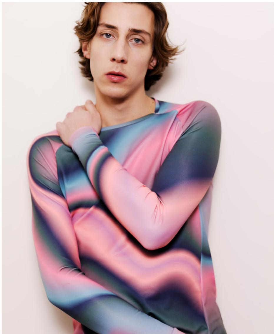
ABOVE: LONG SLEEVE TSHIRT LYCRA