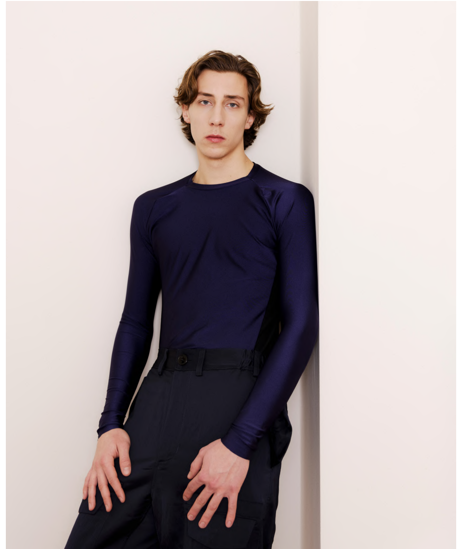
ABOVE: LONG SLEEVE LYCRA T-SHIRT, LARGE CARGO PANT OPPOSITE: PARKA, TSHIRT, FETISH SUIT