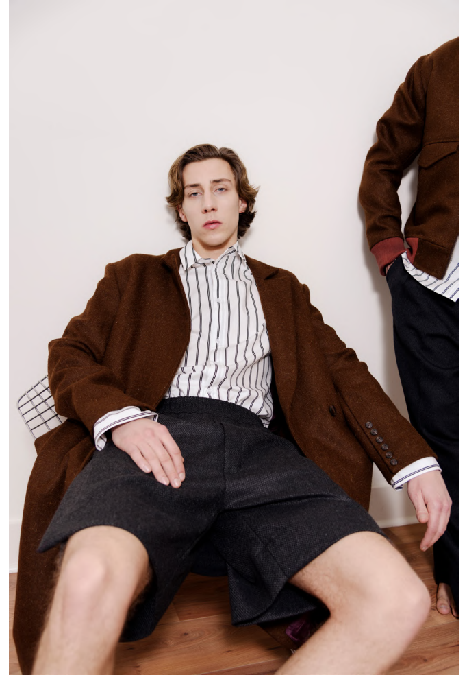
ABOVE: ELASTIC SLIT SHORTS, CLASSIC SHIRT & WINTER COAT OPPOSITE: BOMBER, CLASSIC SHIRT, PLEATED PANT