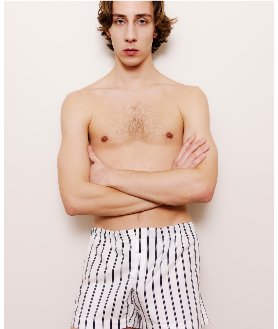
ABOVE: BOXER SHORTS OPPOSITE: MINI SHORTS UPCYCLED PATENT PLEATHER