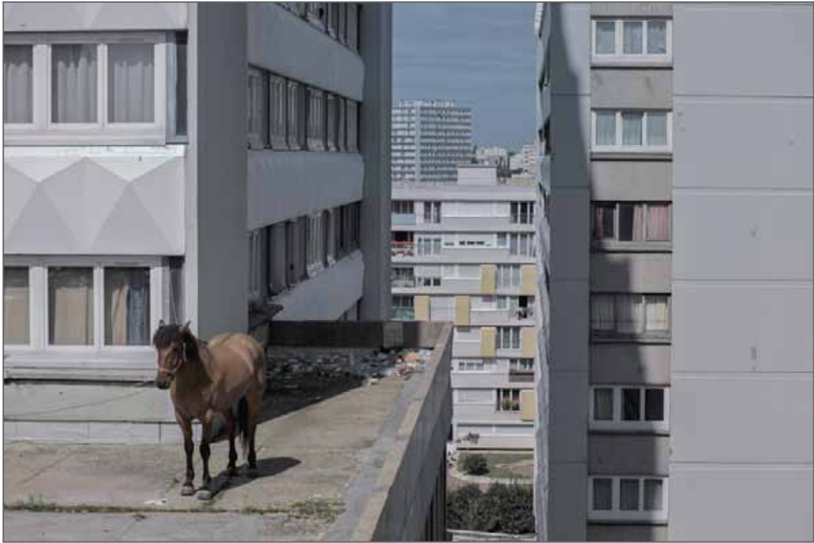
Every day's a Sunday