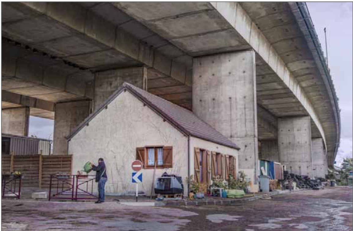
Every day's a Sunday