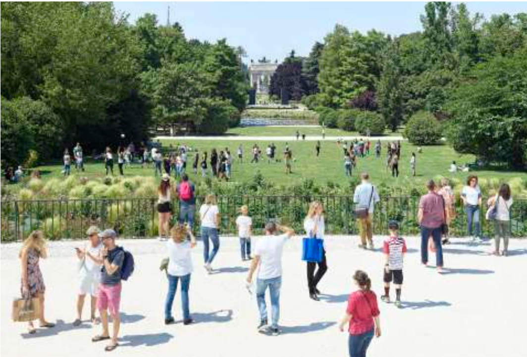
© Osamu Yokonami for Kenta Maeno .