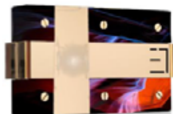
© Ezra + Tuba -Interactive Bag

PREMIÈRE VISION PARIS LAUNCHES THE WEARABLE LAB