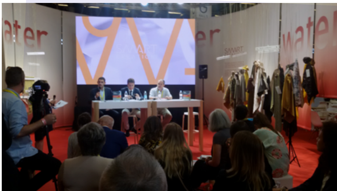
Smart Square – Sept. 16

Through its Smart Creation program – a platform for study and communications – Première Vision's objective is to shed light on the eco-responsible initiatives of its exhibitors, and highlight a new generation of values that help create new strategic perspectives and competitive advantages for the entire value chain of the creative fashion industry.