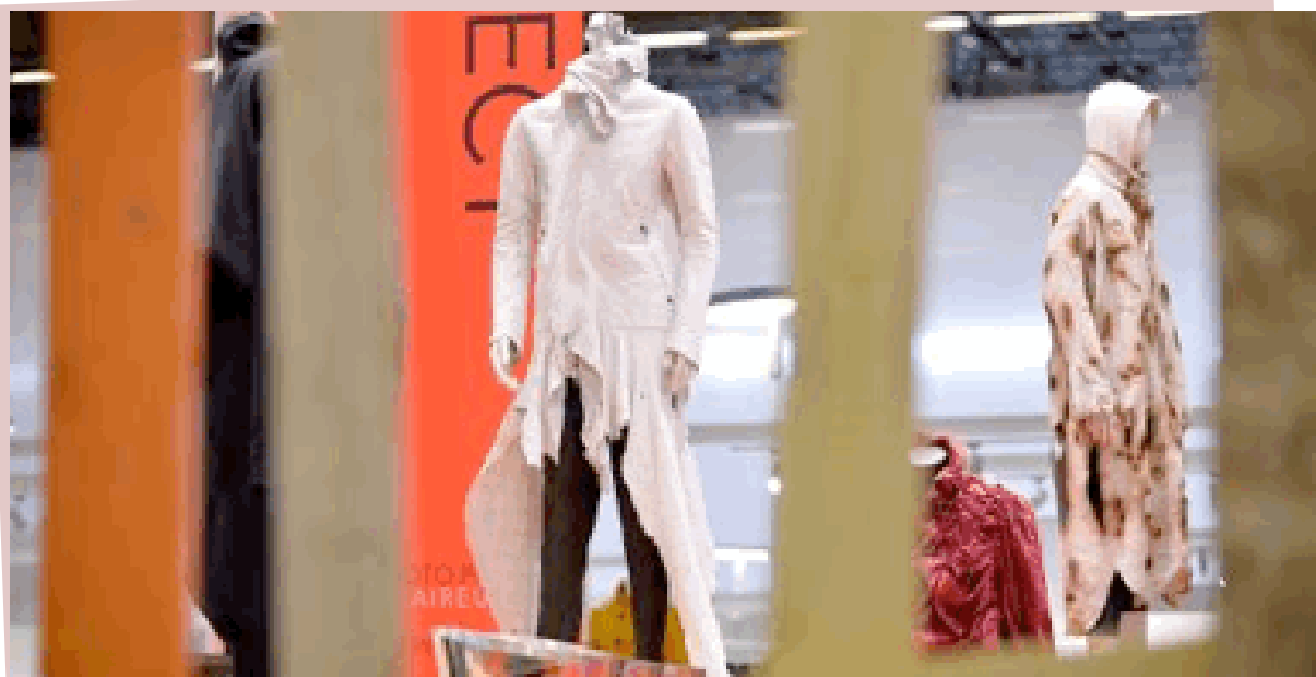
Shigoto Project – Février 2016

CREATIVITY FOR TODAY AND TOMORROW AT THE HEART OF PREMIÈRE VISION PARIS