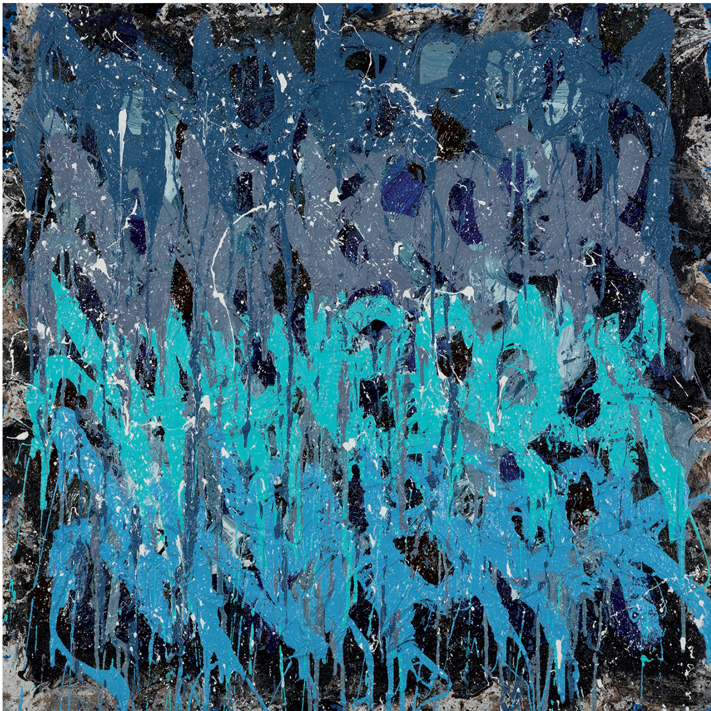
JonOne, Forest Mist , 2014 Oil on canvas, 110 x 110 cm