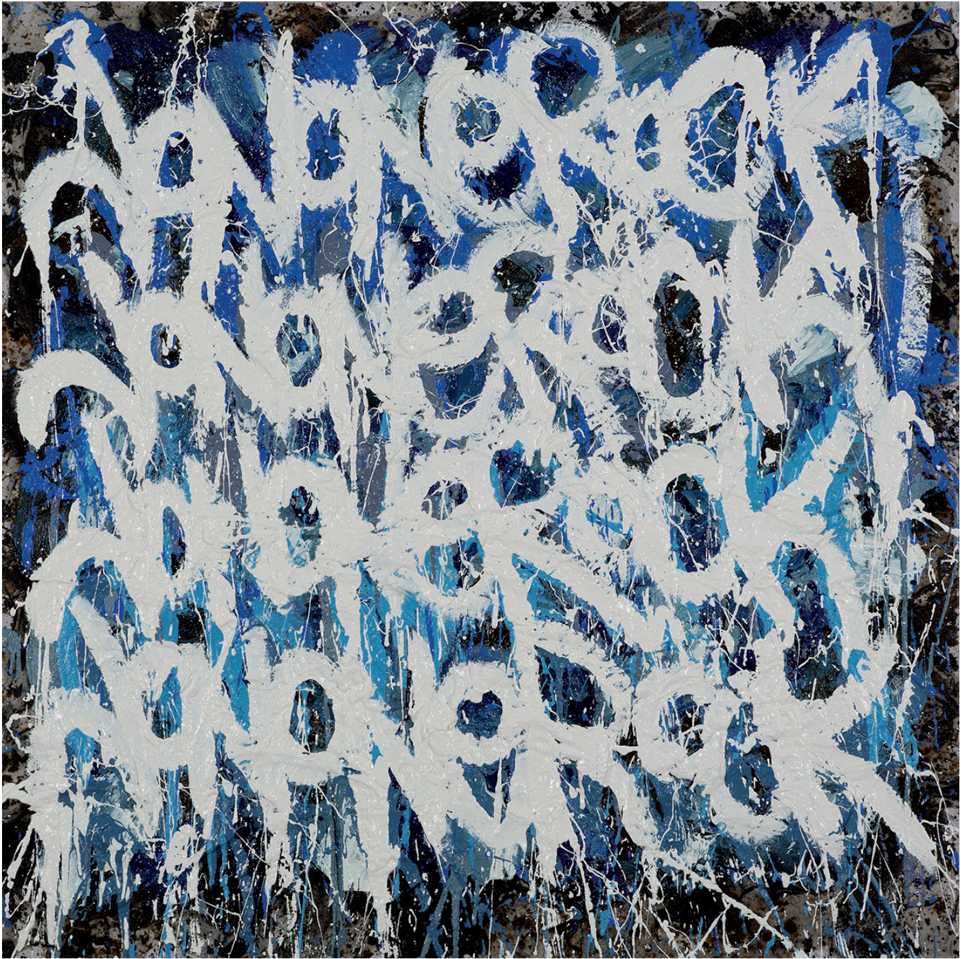
JonOne, Manifestation , 2014 Oil on canvas, 110 x 110 cm