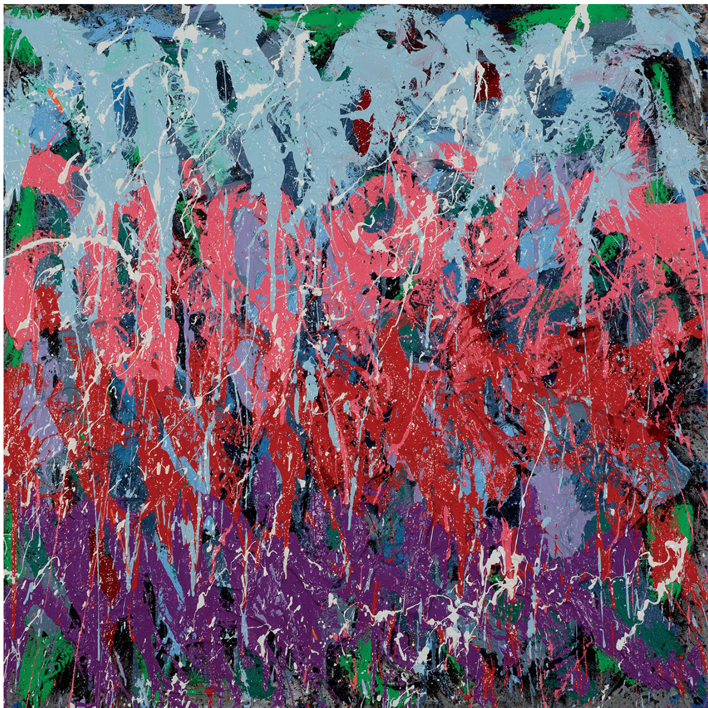
JonOne, Le Combat de ma Vie , 2014 Oil on canvas, 110 x 110 cm