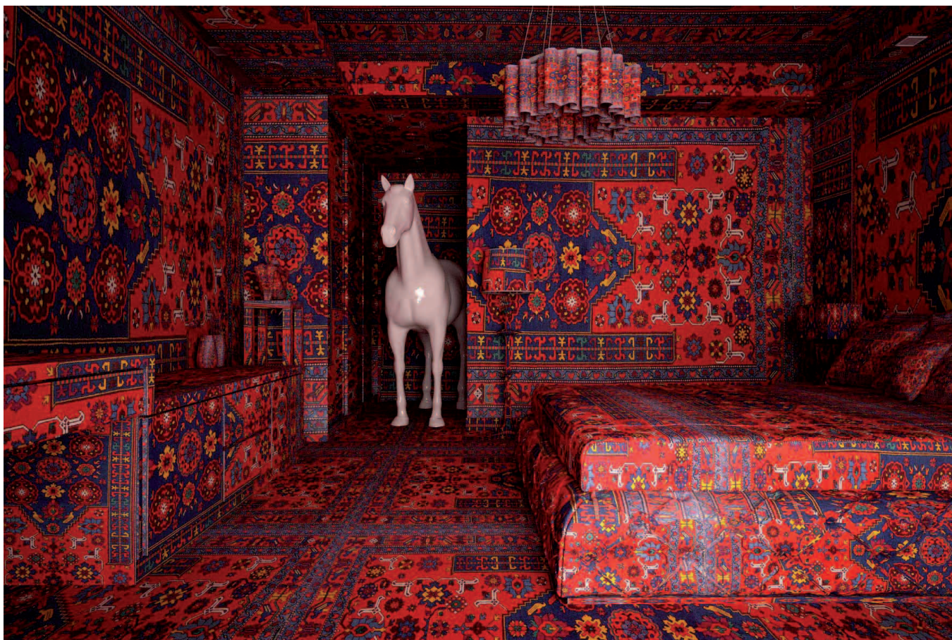
Horse, 100 x 150 cm, digital print on aluminium