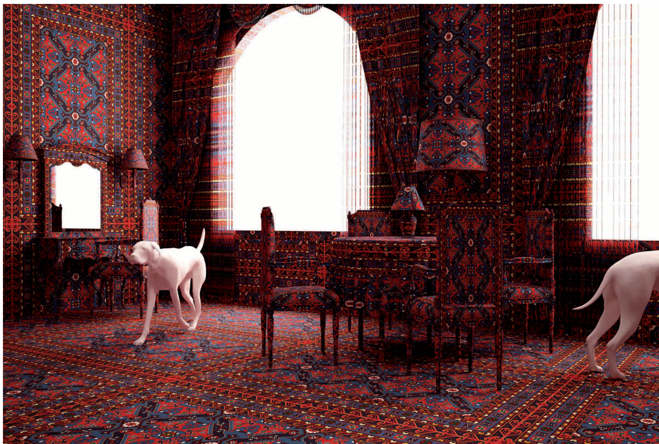
3D view of the exhibition