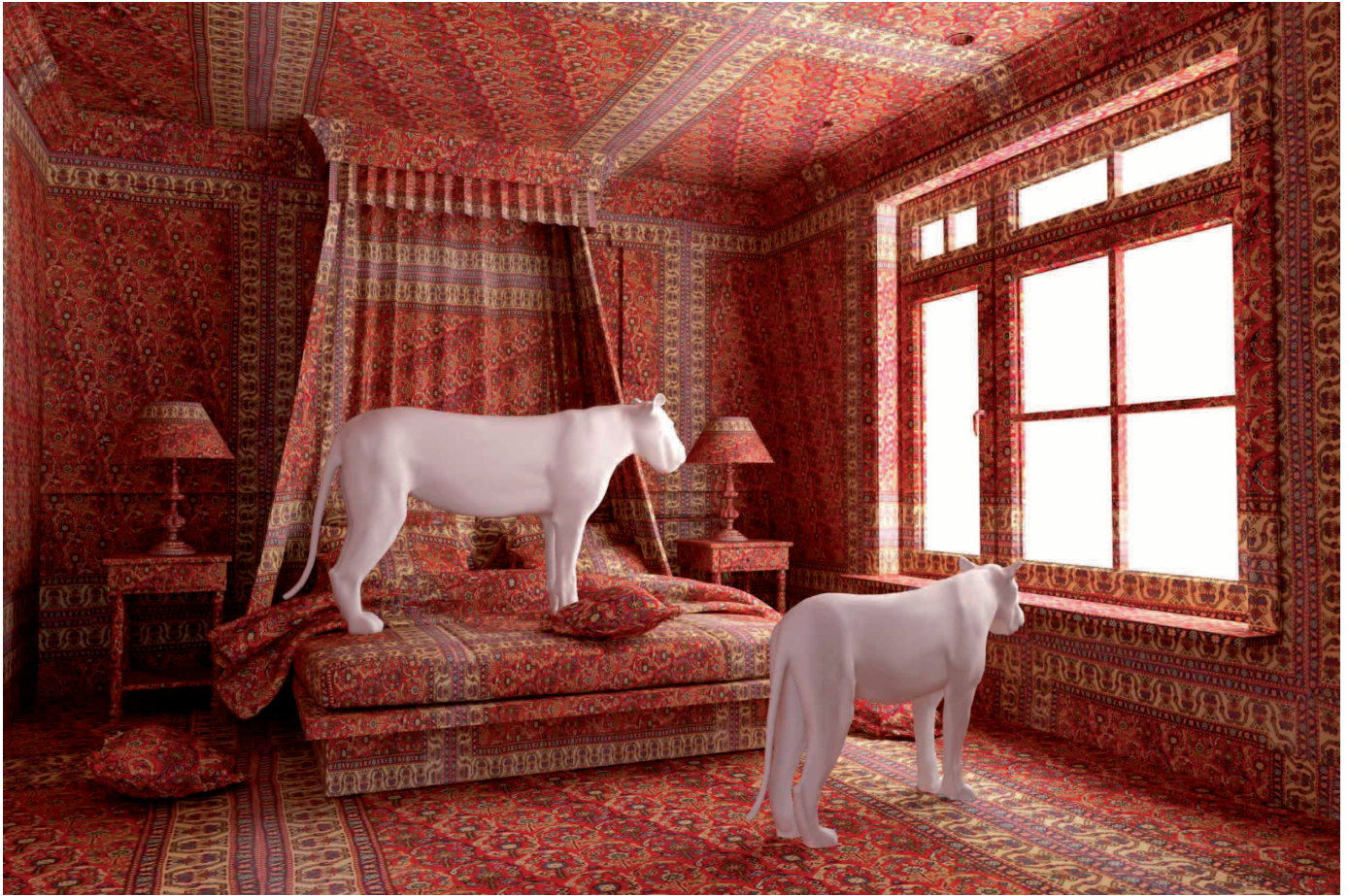
Lions , 100 x 150 cm, digital print on aluminium