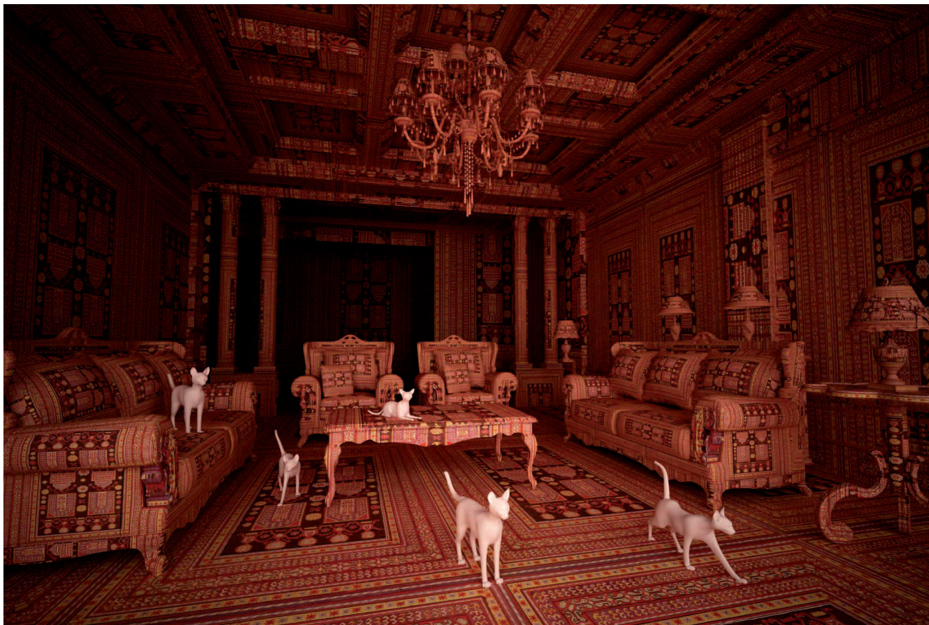
Cats, 100 x 150 cm, digital print on aluminium