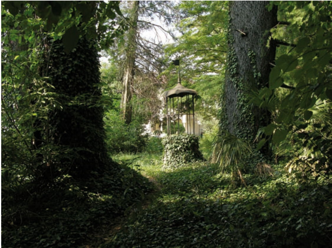
"Waiting for the rain", 2006-2007. Digital print on mat archival paper, 21,6 x 30 cm.