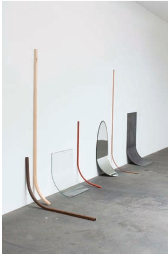
"Andere Bedingung (Aggregatzustand 6)", 2009. Steel, copper, glass, mirror, iron, seven items. Various dimensions.