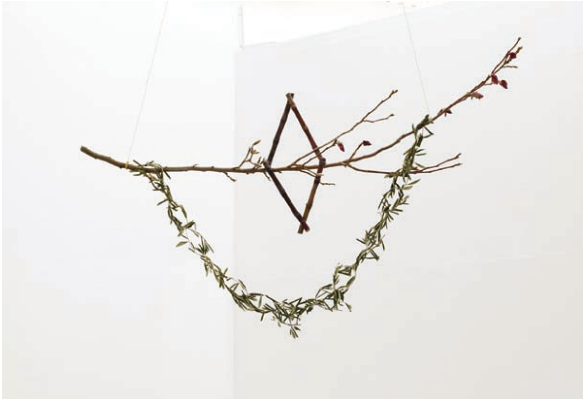
"Ancient Art & Ritual", 2010. Three tree branches (bamboo, magnolia, olive), gold chain. Variable dimensions.