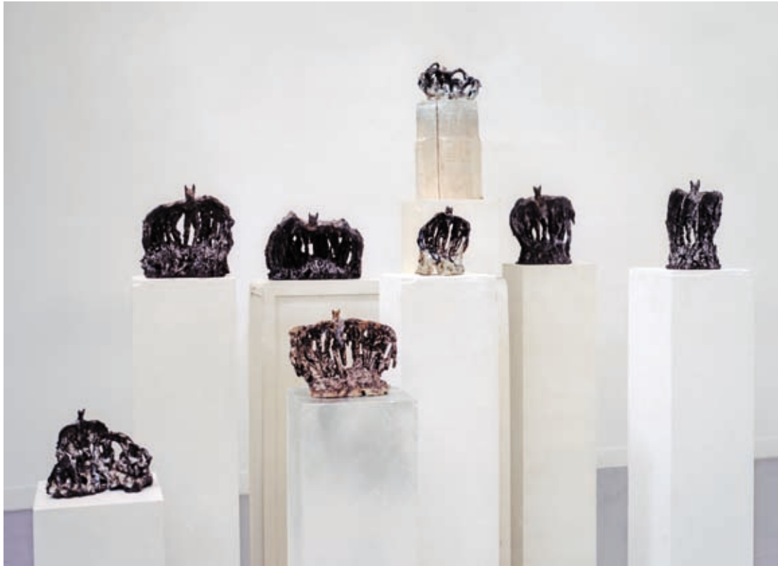
"Batman", 2010. Series of 8 enameled stoneware sculptures. Various dimensions (approx. 20 x 30 cm each).