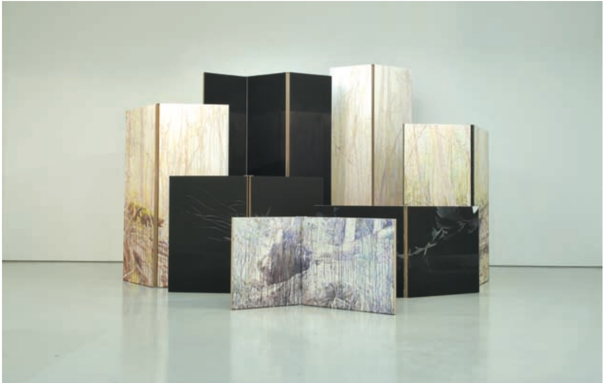
"Reverse Island", 2010. 7 screens, acrylic on wood panel. Variable dimensions. Exhibition view, Musée d'Art Moderne de Saint-Étienne Métropole.