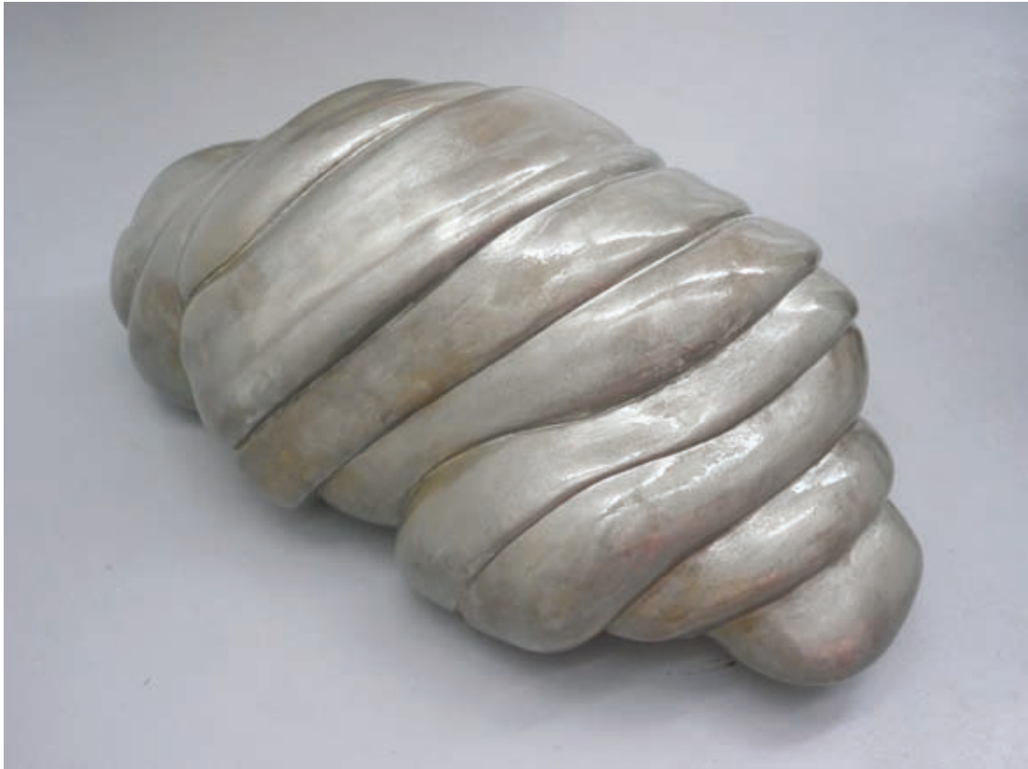
"Could You Be Mine", 2010. Resin, bronze and gold powder. 150 x 50 x 70 cm.