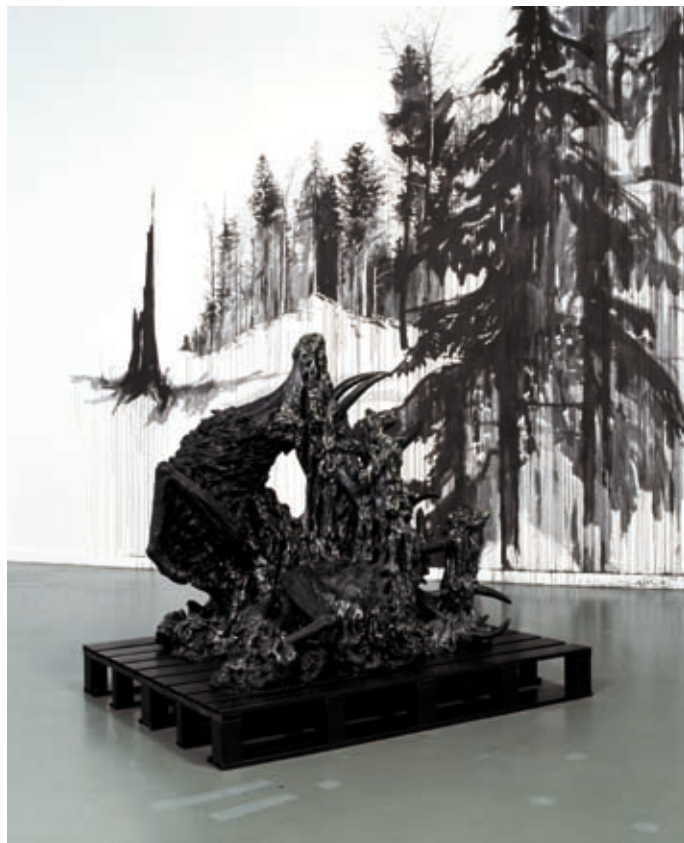
"Untitled (Stag)", 2005. Installation and wall painting, glazed ceramics, India Ink, 165 x 140 x 170 cm. View of the show "Sweetlife", TeNT, Rotterdam. Collection S.M.A.K., Municipal Museum of Contemporary Art, Ghent (Belgium).