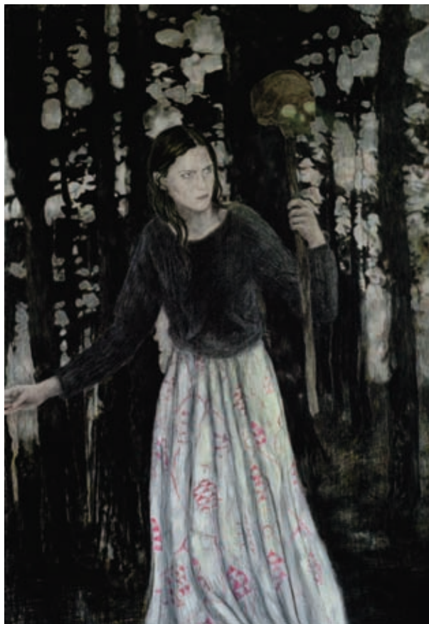
"Into the Woods (After Billbin)", 2004. Pencil, crayon, watercolor, charcoal on paper. 210 x 150 cm. Courtesy Galerie Bugada & Cargnel, Paris.