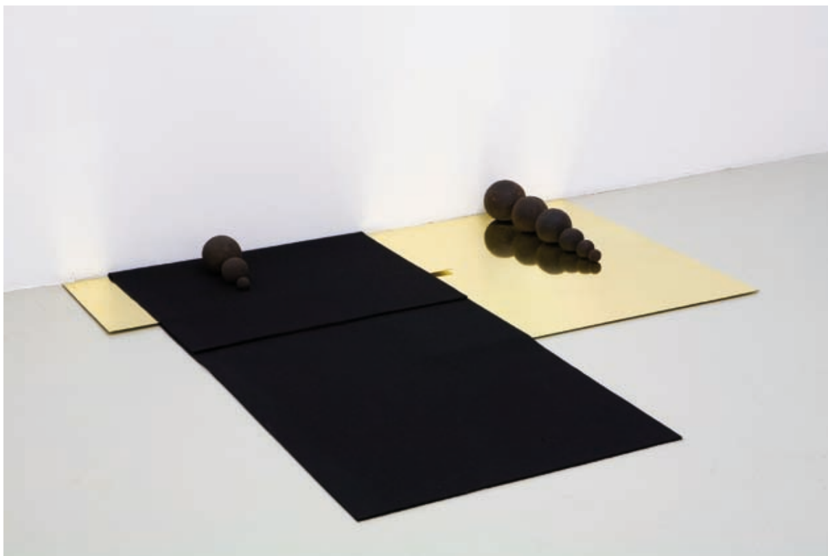
"The full moon's meditation", 2010. Brass, felt, mud balls. 100 x 110 cm.