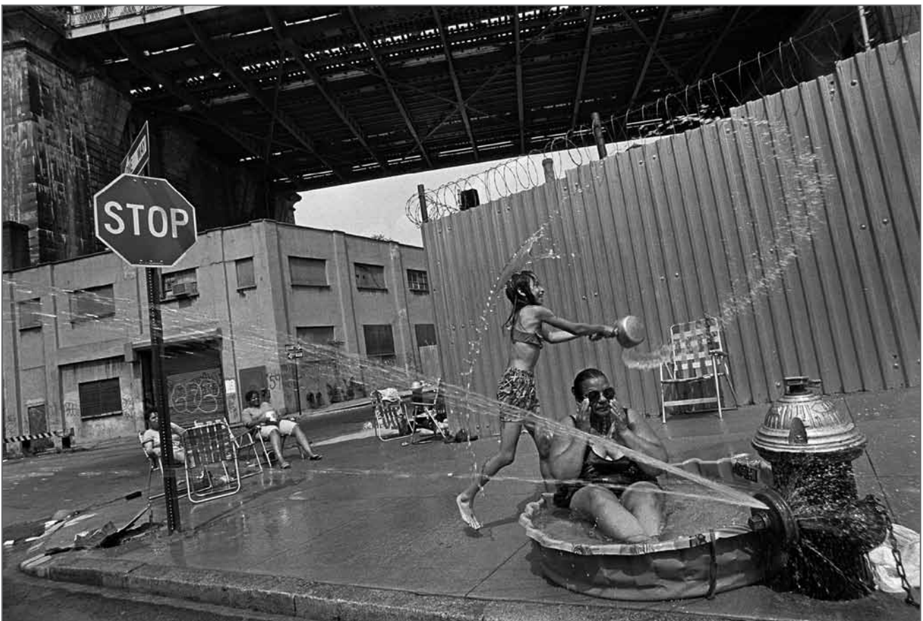
Brooklyn, New York, 1993. A grandmother relaxes in a small plastic wading pool as her granddaughter splashes water from a pot beneath the Manhattan Bridge.