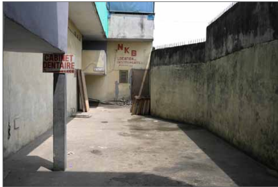
Untitled, Adjamé, Abidjan 2017 Courtesy gallery Clémentine de la Féronnière © Adrien Boyer