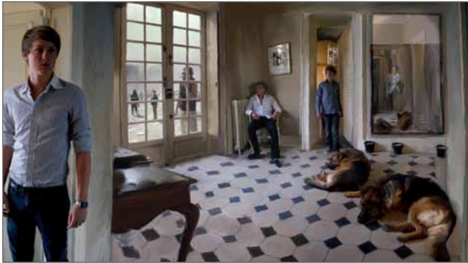
"The noise of the world", 2010 © Bachelot-Caron