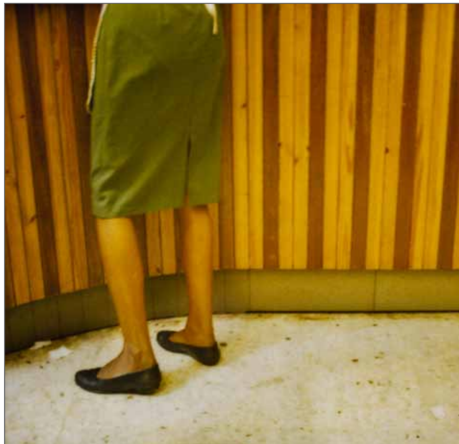
"Asmara Dream #35"