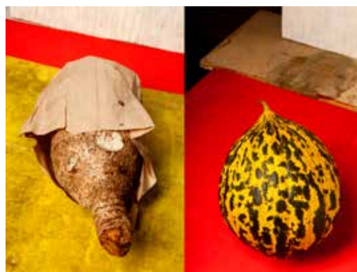
LORENZO VITTURI Italy | United Kingdom

The Photography Grand Prix of the jury went to Lorenzo Vitturi.