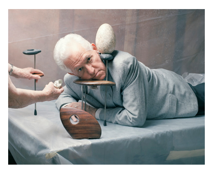
Papé, Atlas Contemporain de Processus de Corps Humains, 2012