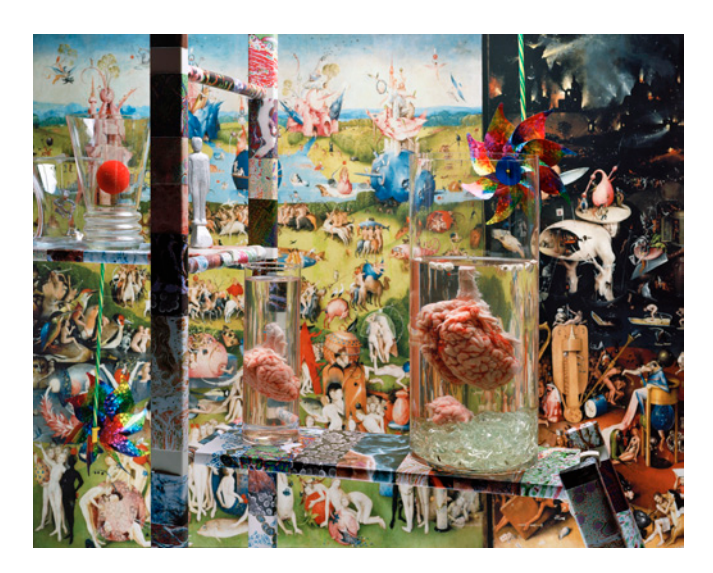
Arborisation Terminale, Atlas Contemporain de Processus de Corps Humains, 2012