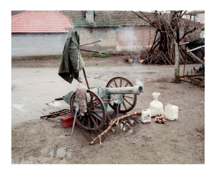
Cannon, Liparo, 2011