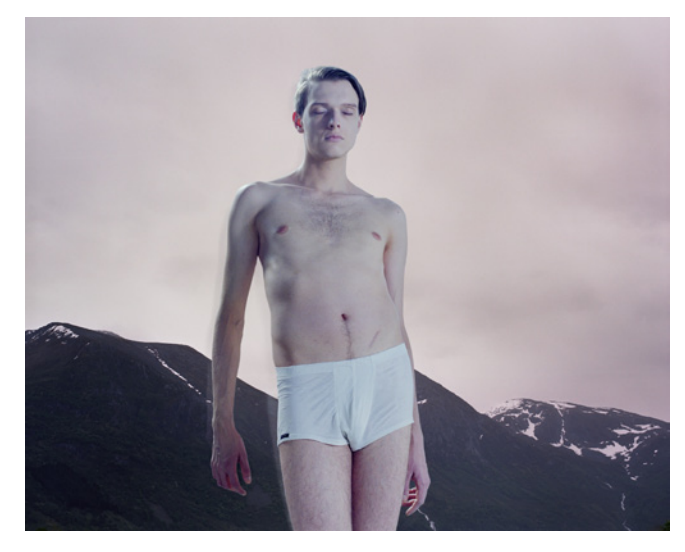
Man in a landscape, Leakage, 2011