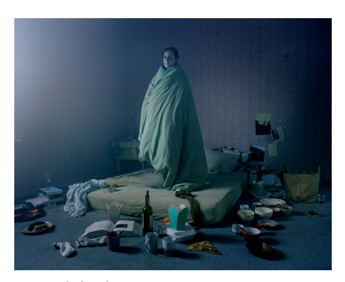
Woman in bed, Leakage, 2011