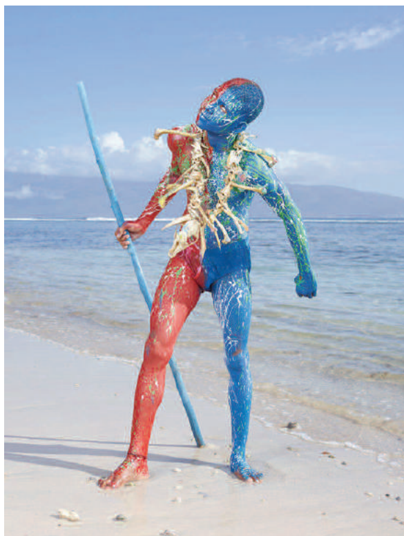
Pintao, Barahona, Dominican Republic, series Cimarron , 2014-2018