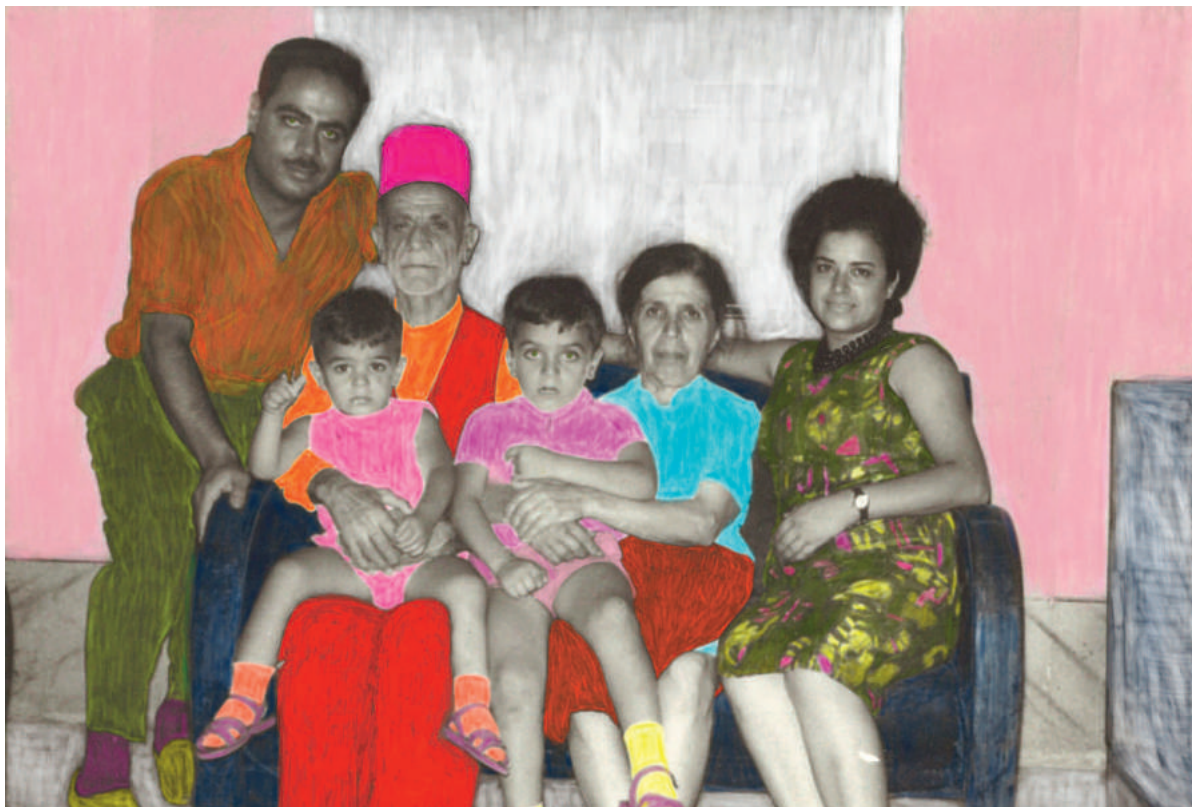
Untitled, 2019. Series L'Amour se porte autour du cou