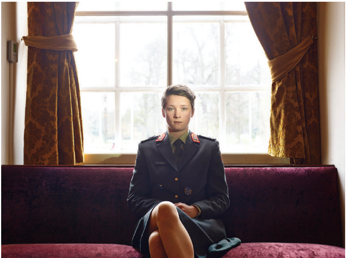
Royal Military Academy, Breda, The Netherlands. Series Cadets

Paolo Verzone is represented par l'Agence VU'.