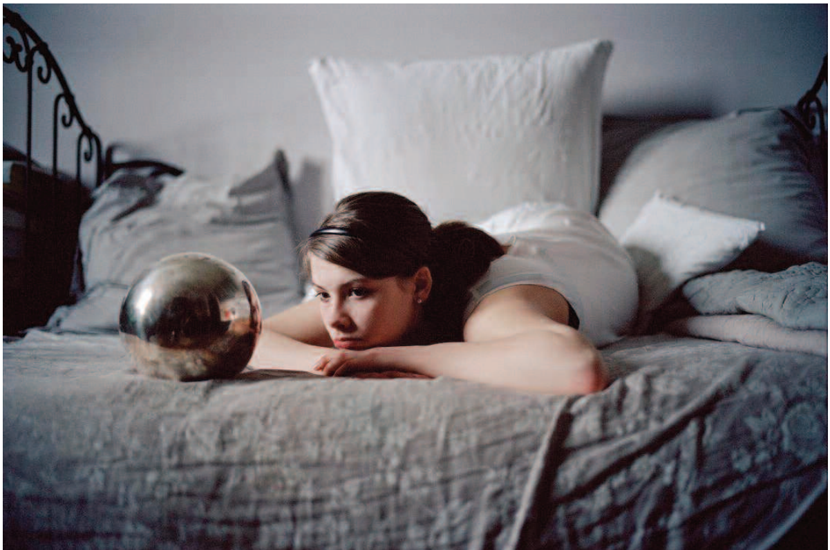
The crystal ball, 2008. Series Sasha

Claudine Doury is represented by VU' agency and by in camera Gallery, Paris.