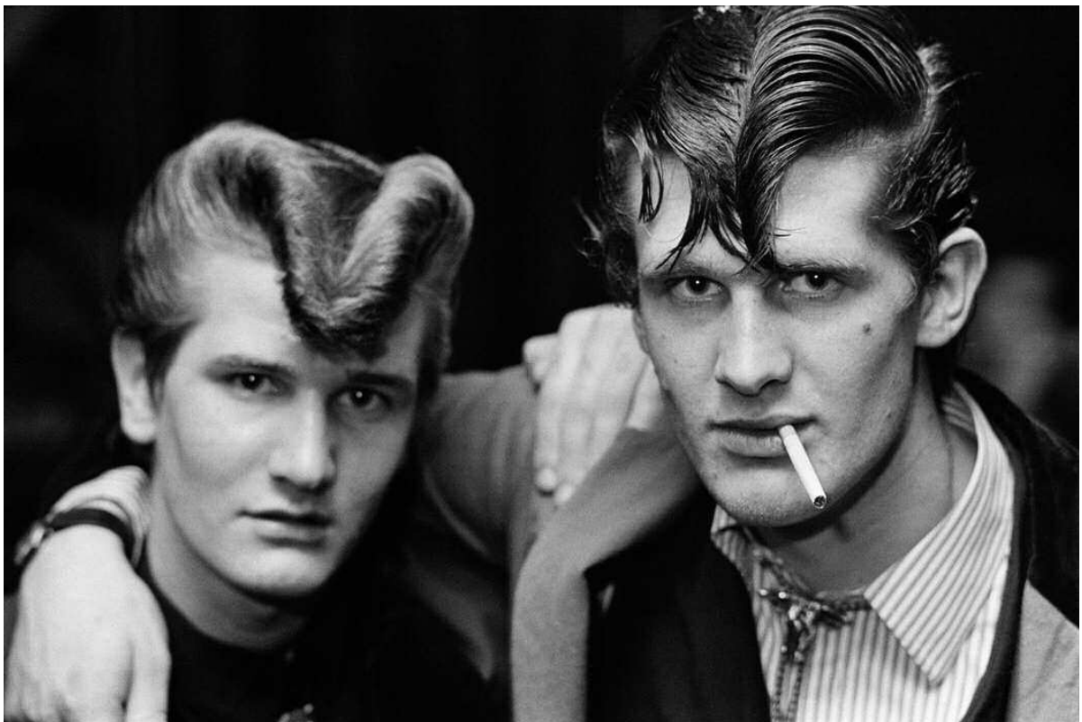
Red Deer, Croydon, 1976. Series The Teds

Chris Steele-Perkins is represented by the Magnum Photos Agency.