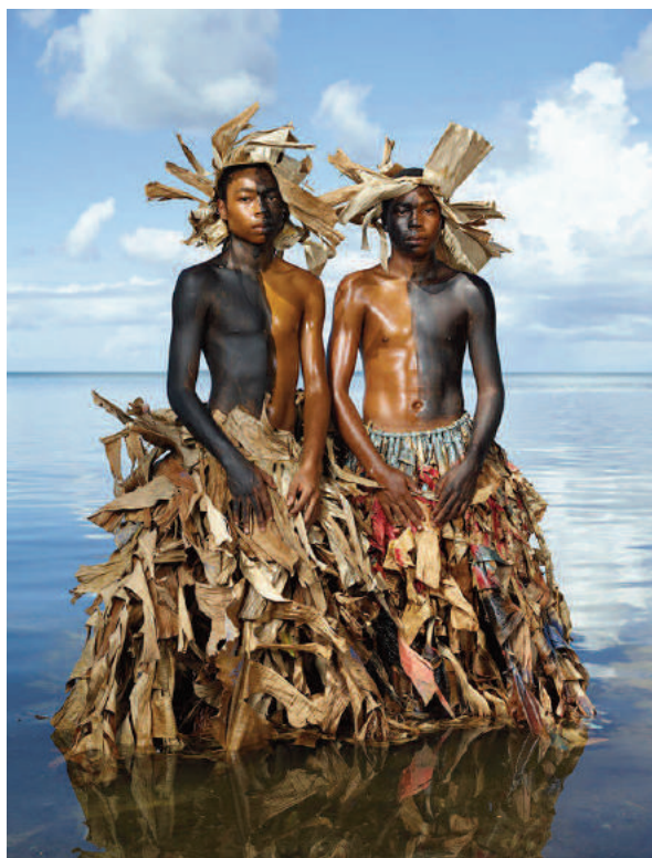
Mas a terre, Baie-Mahault, Guadeloupe, France, series Cimarron , 2014-2018