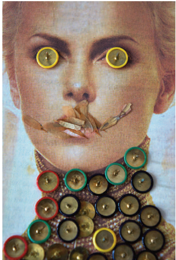
Mascarade, 2015-2016