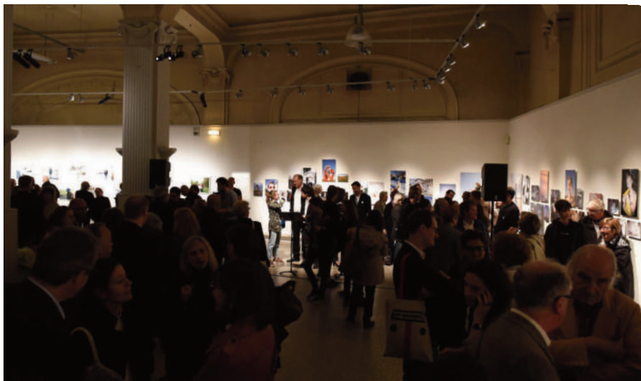
Portrait(s) Festival, Vichy Cultural Centre, 2019

19:00 : Official opening of the exhibition by Charles Fréger on the Lac d'Allier promenade